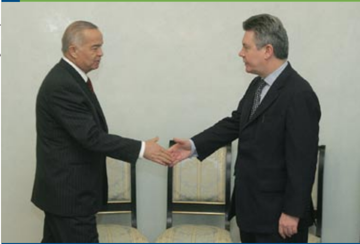
OSCE Chairman-in-Office, Belgian Foreign Minister Karel De Gucht (right), met with President of Uzbekistan Islam Karimov during his visit to Tashkent.