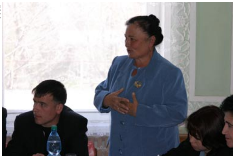
Leaders of mahallas, or self-governing communities, are offered training in financial and legal skills at courses supported by the OSCE Centre in Tashkent.

The OSCE Centre in Tashkent has successful experience of such publication carried out jointly with National Human