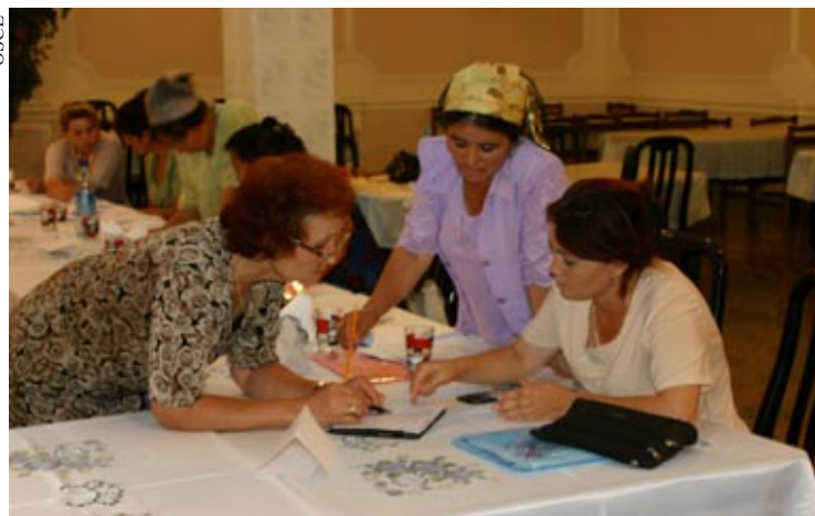
The specialists, who in charge of working with women in rural areas, increased their economic and legal knowledge during these trainings.

In addition, a roundtable discussion was held with representatives from local authorities and respective agencies to discuss problems and perspectives of women entrepreneurship.