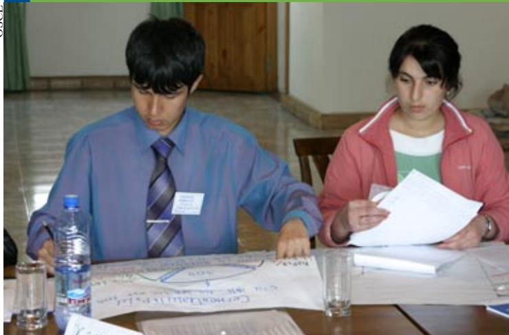
Participants were required to develop their own business ideas, which were reviewed by expert and trainers.