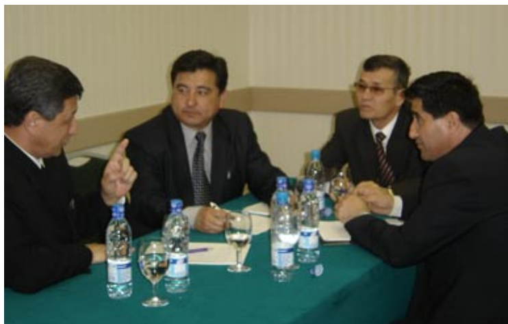
Participants shared with experience and opinions related to the cooperation between Parliament Committees and Ombudsman institution.

On 20 February, Representatives from the Senate and the Legislative Chamber of Parliament of Uzbekistan and