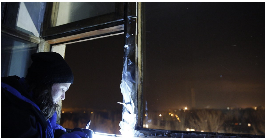
OSCE SMM monitor conducting night time observations by listening and recording ceasefire violations in Horlivka, eastern Ukraine, 18 November 2016.