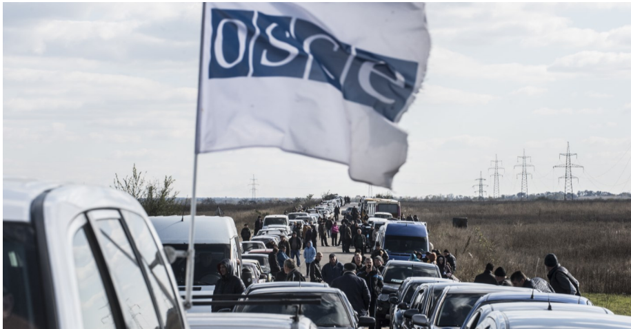
Civilians queuing at the exit-entry crossing point near Marinka, eastern Ukraine, October 2016.