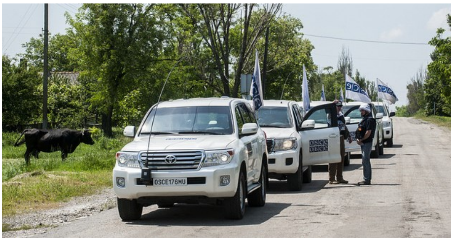
OSCE SMM patrolling in Pavlopil in eastern Ukraine, May 2016.