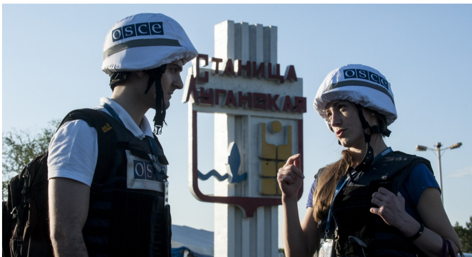
OSCE SMM members in Stanytsia Luhanska, Luhansk region, May 2016.