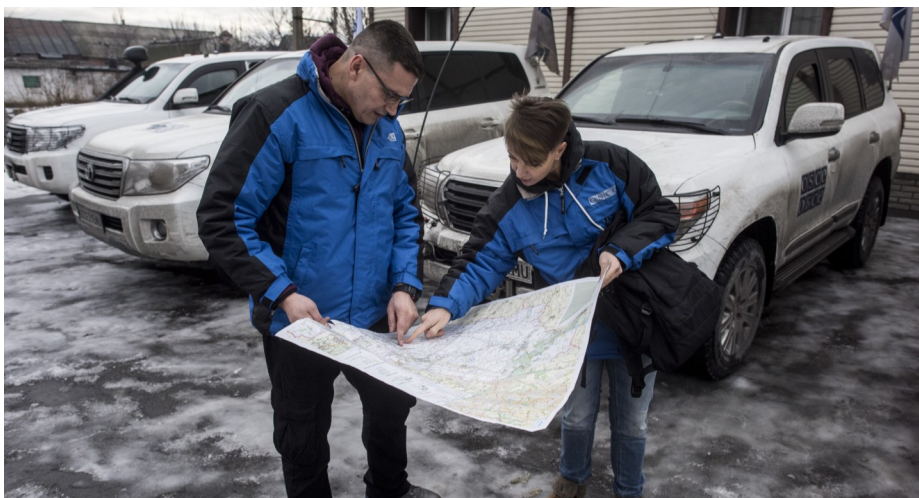
OSCE monitors preparing for patrol, 14 January 2016.