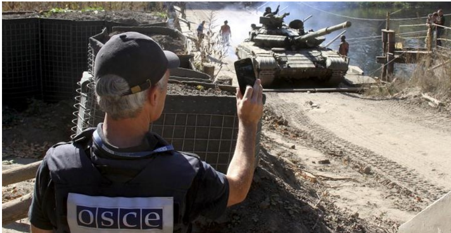
OSCE SMM monitoring the withdrawal of tanks in Luhansk region, 5 October 2015.