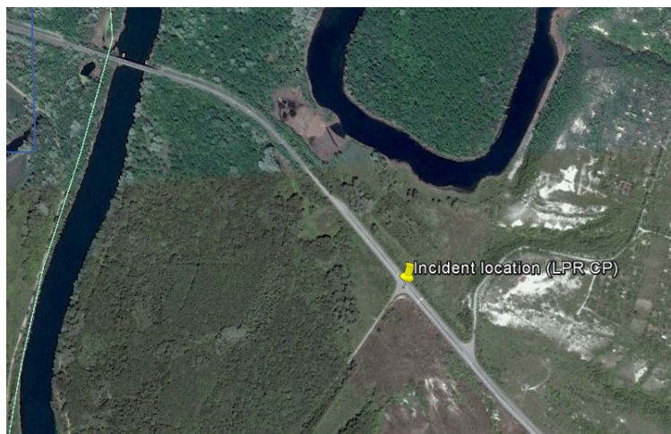
SMM patrol caught in fire in Shchastia on 26 July 2015, but comes out unharmed.