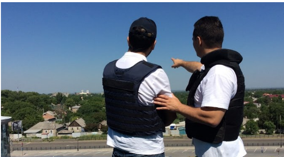
SMM monitors at the observation point on the railway station in Donetsk, June 2015.