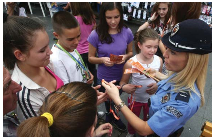
Building confidence between the police and the public is one of the priorities of the SPMU.