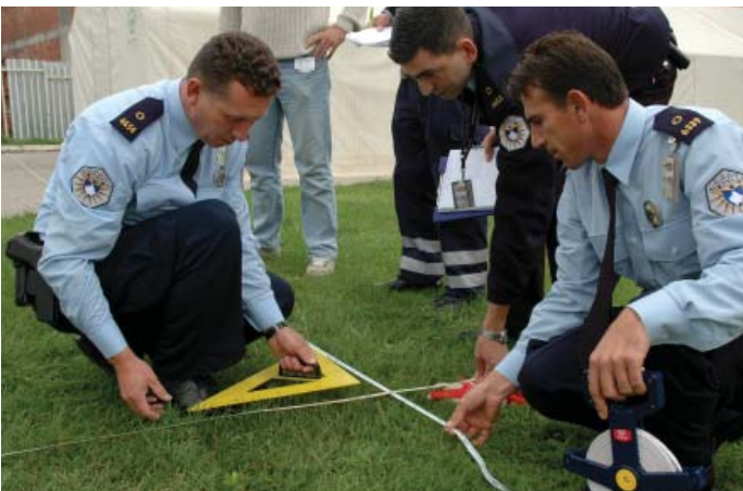
Crime scene investigation courses aim to enhance the capabilities of the police.