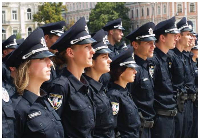
The SPMU supports OSCE field operations in their work to strengthen the basic training of police.