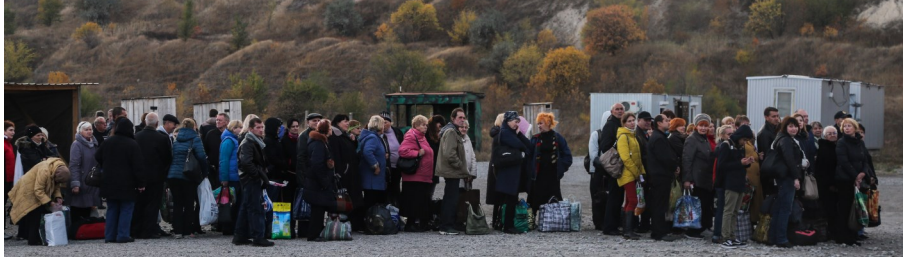
Civilians standing in line at the Novotroitske EECP, Donetsk region