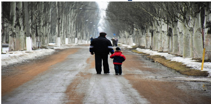
People on the street in non-government-controlled Holmivskiyi, Donetsk region