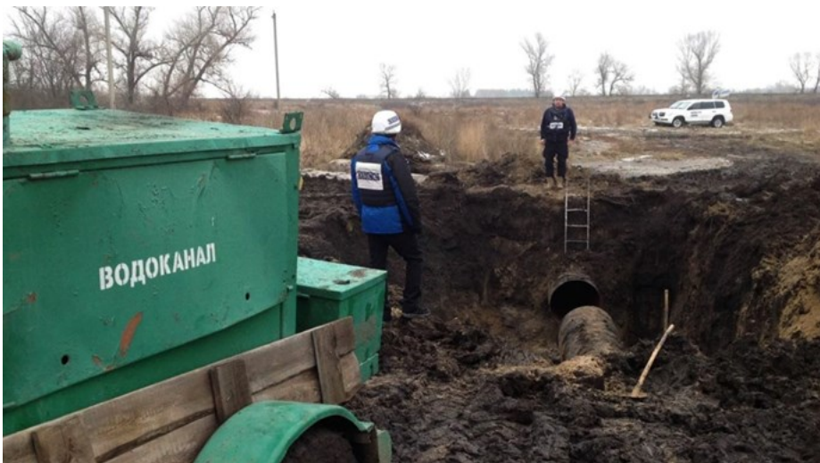
SMM monitoring officers monitoring repairs to water pipelines in eastern Ukraine