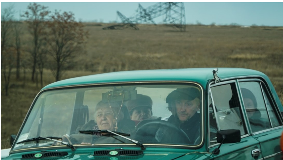
Civilians crossing the contact line near Marinka, Donetsk region