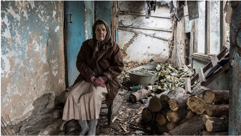
An elderly resident in her home in Novooleksandrivka, Luhansk region