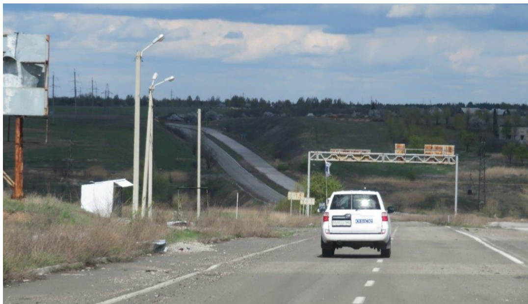
OSCE SMM on patrol near Yasynuvata, Donetsk region, 23 April.