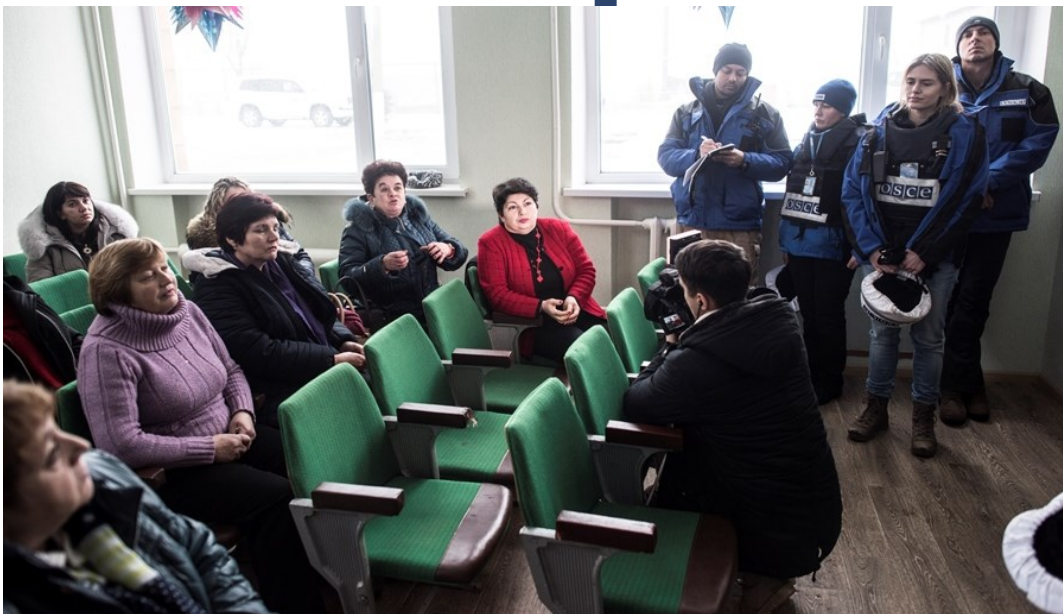
OSCE SMM monitors engage with the head of the village council and other residents of Chermalyk, Donetsk region.