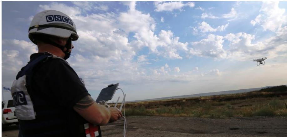
OSCE SMM monitor operating a mini-unmanned aerial vehicle near Debaltseve, Donetsk region.