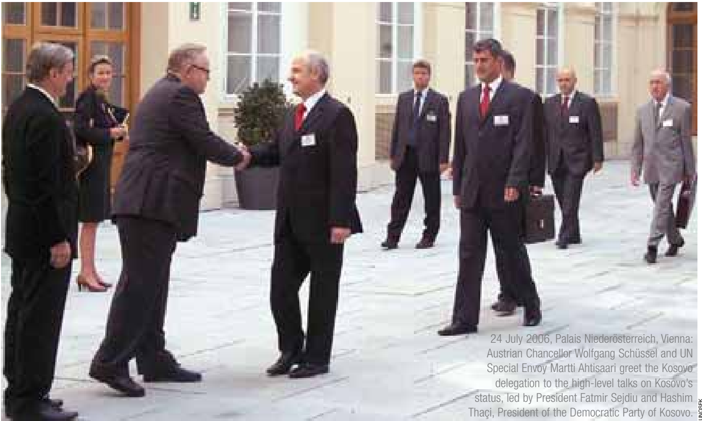
24 July 2006, Palais Niederösterreich, Vienna: Austrian Chancellor Wolfgang Schüssel and UN Special Envoy Martti Ahtisaari greet the Kosovo delegation to the high-level talks on Kosovo's status, led by President Fatmir Sejdiu and Hashim Thaçi, President of the Democratic Party of Kosovo.