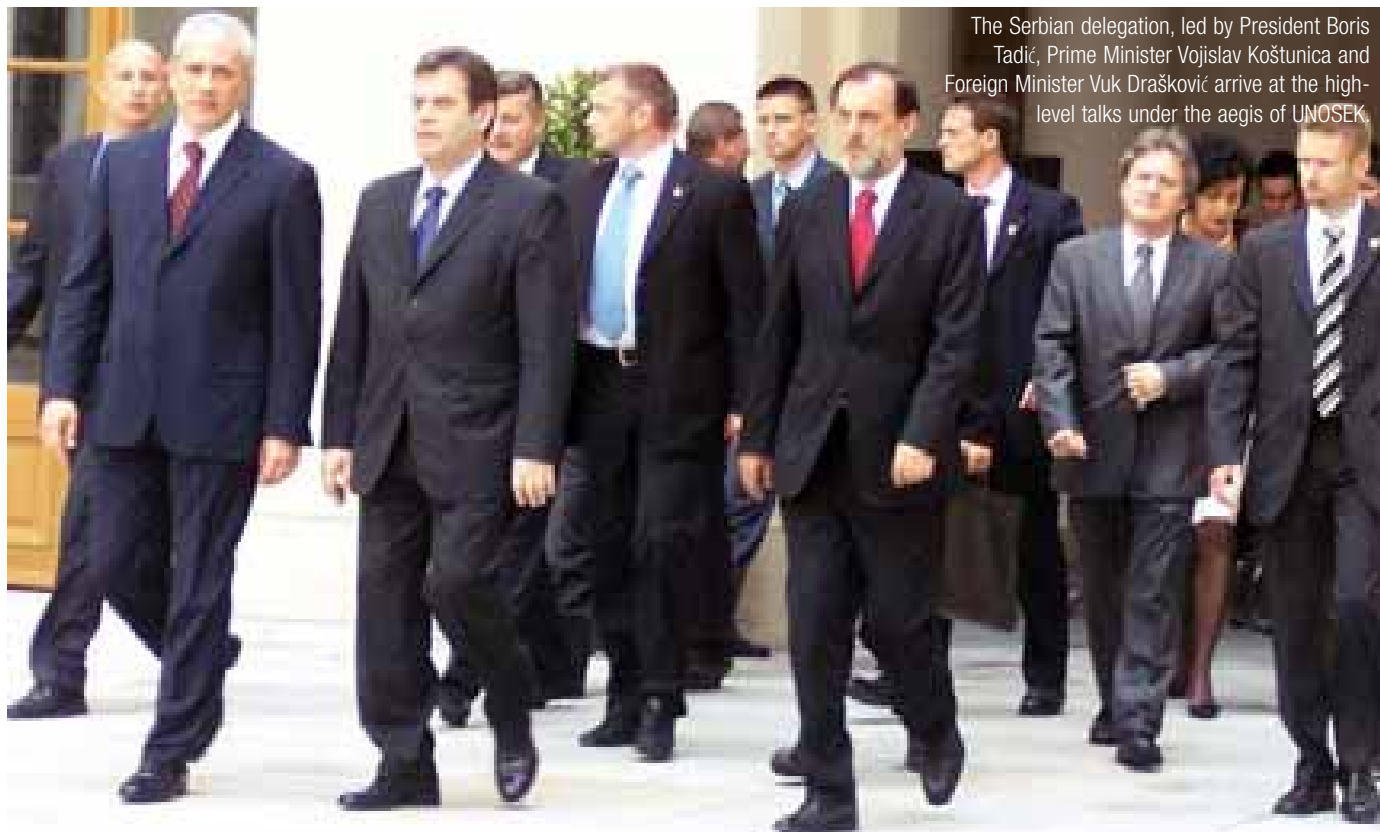
The Serbian delegation, led by President Boris Tadić, Prime Minister Vojislav Koštunica and Foreign Minister Vuk Drašković arrive at the high-level talks under the aegis of UNOSCEK.