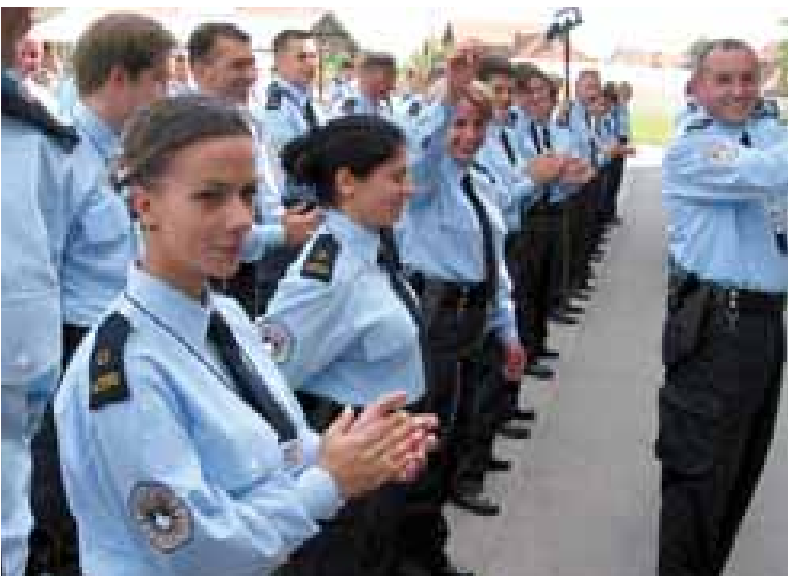
Some 15 per cent of the Kosovo Police Service are female graduates of the Police Academy.