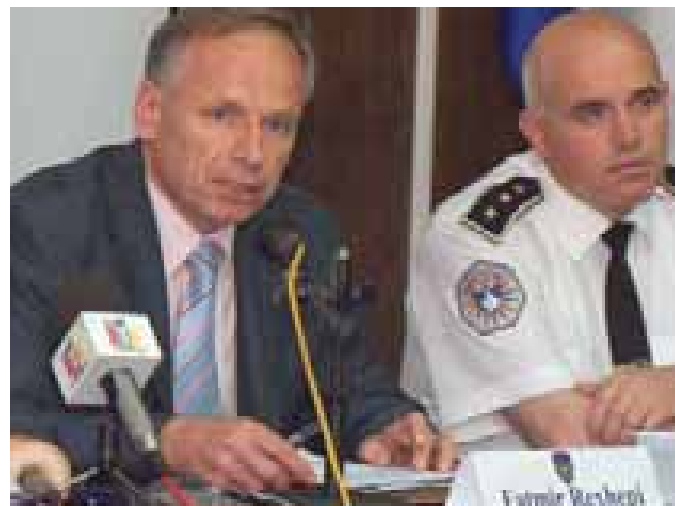
28 June 2006: Minister for Internal Affairs Fatmir Rexhepi (left) and Deputy Police Commissioner S. Ahmeti address the press at the launching of the Police Inspectorate of Kosovo.

“Inspectors will alternate between the classroom and the field,” says Mr. Smith. “They will learn to gather and analyse answers to such questions as: Are the police investigating crime properly? Are they proactively ensuring that every one — including members of minorities — is enjoying safety, security and freedom of movement? Are they developing and implementing strategies to reduce deaths and injuries on Kosovo’s roads?”