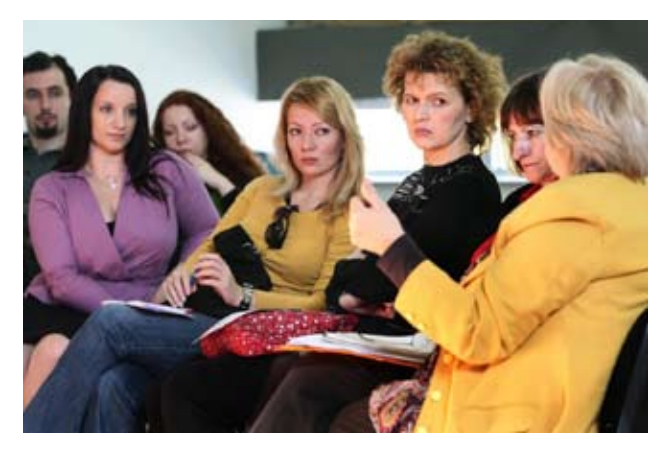
Debate on environmental priorities in the region.

Supported through an extra budgetary contribution by the Italian Development Co-operation, the project assessed the environmental insecurities in seven towns in South Serbia. Using the questionnaires developed by the implementing partner in this project, NGO Environmental Ambassadors, the representatives of the local authorities evaluated both objective and subjective perspectives of environmental threats in their immediate surroundings. The project wrap-up and presentation of the findings was supported by the OSCE Mission and facilitated by the Ministry of Environment and Spatial Planning, and the Standing Conference of Towns and Municipalities.