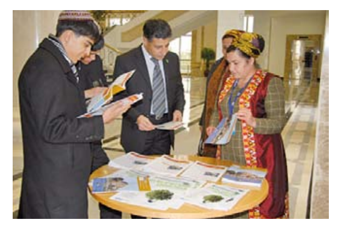
Spectators in the cinema hall, Turkmenistan.

The concept of sustainable development is at the forefront of the OSCE Project Co-ordinator in Ukraine's (PCU) economic and environmental activities. With the view to raise environmental awareness of school students and promote the concept of sustainable development, the PCU began development of an innovative educational resource tool - Green Pack following successful implementation of Green Pack initiatives in fourteen other countries. The feasibility study was conducted in July 2009 and the adaptation of the Green Pack teachers' handbook was carried out in late 2009 - early 2010. 6500 copies of the teacher's handbook have been published and are being disseminated to Ukraine's schools. In addition, the PCU has engaged with environmental NGOs active in the promotion of a positive environmental attitude. The PCU also struck partnerships with a number of international organizations present in Ukraine to cultivate environment-friendly practices. Plans for 2010 and 2011 are to increase the network of Green Pack partners, to develop the Green Pack CD and DVD of short documentaries on environmental subjects, to create Green Pack Junior targeted at primary school students, to produce an additional five to seven thousand copies of the Green Pack sets and to distribute them to Ukraine's schools and NGOs promoting environmentally friendly attitudes.