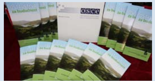
Heritage for the Future, eco-documentary. (Aleksandar Vlajic)