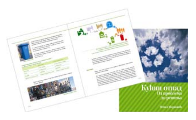
Project: Communal Waste – From Problem to Solution, in Serbia.

The OSCE-supported project, which aimed to raise the awareness of energy savings and sustainable use of energy resources in urban areas, gathered representatives from industry, educational institutions, media and civil organizations in five cities across Serbia: Nis, Kragujevac, Gornji Milanovac, Kruševac and Sremska Mitrovica.