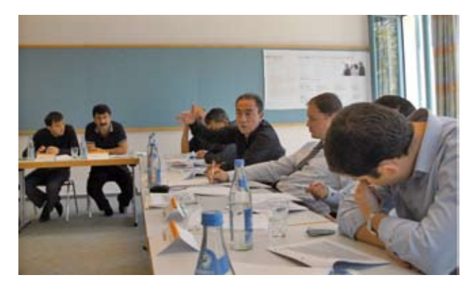
Debates during 3 day training course at the Bank Academy on AML in Beilngries/Bavaria.

In 2009, the OSCE Project Co-ordinator in Uzbekistan (PCUz) initiated a two-year project to help build the operational capacities of the relevant Uzbek anti-money laundering/countering financing of terrorism (AML/CFT) structures, namely the Financial Intelligence Unit within the Office of the General Prosecutor and the Central Bank. The PCUz provided expert advice to the drafting of internal rules and regulations for the banking sector concerning the detection of suspicious transactions. Moreover, it organised a visit of nine Uzbek AML specialists to meet with German AML institutions and to