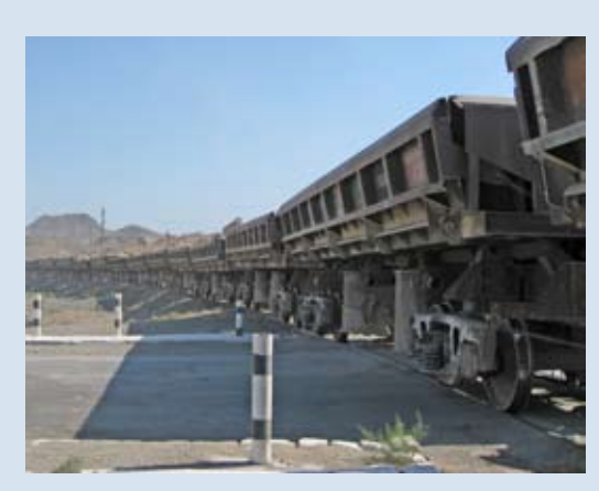
A freight train in Turkmenistan, 2 July 2009. Turkmenistan is an important country along the trans-Caspian railway routes.

The conference was a part of ongoing efforts to promote trade and transport security in the region.