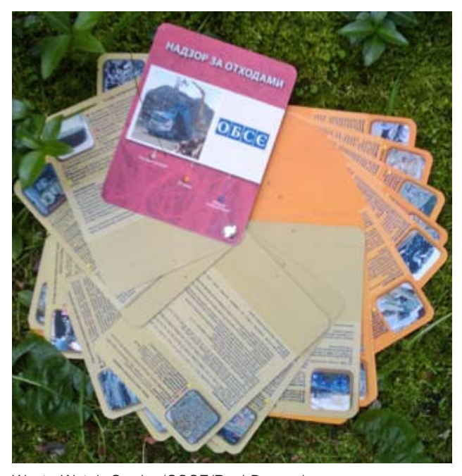
Waste Watch Cards.

7.2.1. Land degradation and waste management, including radioactive waste in Central Asia