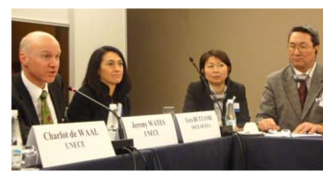
Aarhus Centres Meeting in Istanbul, Turkey.

In January 2010, the OSCE convened the second Aarhus Centres Meeting in Istanbul, Turkey (the first had been held in January 2009 in Vienna) which brought together government and Aarhus Centre representatives from South-Eastern Europe, Eastern Europe, the South Caucasus and Central Asia, the UNECE, the OSCE