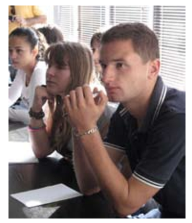
In the municipality of Sekovici in eastern Bosnia and Herzegovina young people participate in entrepreneurship training.

businesses, employment bureaus and youth NGOs interested to learn about the practical issues involved in developing business plans and starting new businesses. Over the past year, 350 young people have participated in 28 seminars, leading to the establishment of 30 new businesses and 35 young persons have been placed in companies in different municipalities. Out of the 28 training workshops, 6 have been organised and implemented entirely by local partners without OSCE financial support. This has been a positive development in which the municipalities