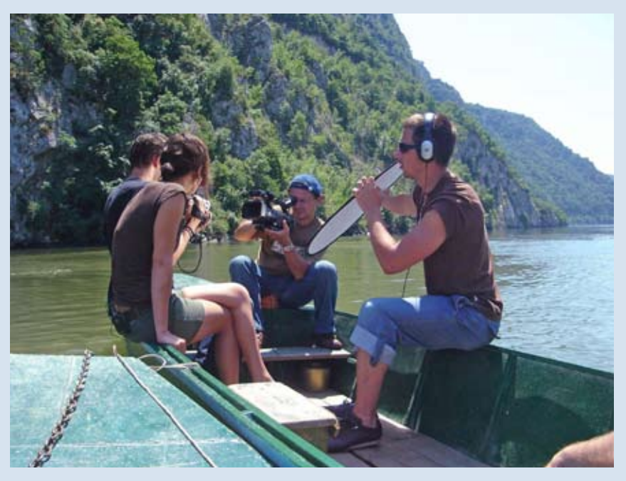
Filming on the Danube. (Aleksandar Vlajic)

The objective of the film was to promote environmental responsibility in an appealing and educational manner to school-age students. The film was disseminated through schools, youth centres and other educational facilities and exposed to large numbers of viewers. It is also available on the YouTube OSCE Channel http://www.youtube.com/ watch?v=swYFhb4POt0.