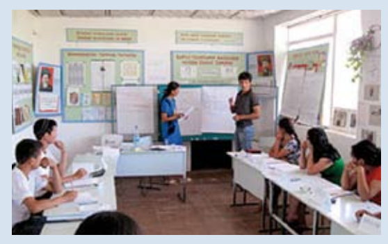
Young people from a rural region of Kyrgyz Republic at a training course on entrepreneurial skills, Karabak, Batken region, 15 July 2009.

opportunity to collaborate with urban youth to develop their skills in preparing small scale business plans. This exercise was mutually supportive since it was able to both help diversify the rural economy and to improve the understanding of urban entrepreneurs in doing business in the regions. The project had a positive impact in many ways by encouraging new leaders, fostering the social and economic development of remote rural areas and enhancing interregional understanding.