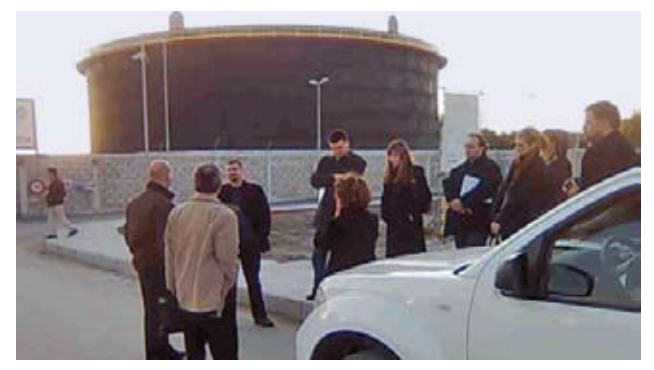
Regional Environment Agency representative explains the challenges of ensuring public consultation in Albania to a visiting OSCE-sponsored delegation from Bosnia and Herzegovina, February 2010.

Assistance to the Government with regard to the implementation of the Aarhus Convention has continued to be provided. Key to this support has been the network of Aarhus Information Centres, which present an interface between state structures and the public to facilitate dialogue on matters of local concern relating to environmental protection and community health. These Centres have been supported to conduct public outreach activities in remote communities in three regions aimed at promoting public awareness of the Convention's provisions with respect to locally identified problems including solid waste pollution, over fishing and illegal forestry. The Centres have also organised workshops aimed at highlighting public officials' legal obligations to routinely provide citizens with information, and to consult with the public in planning processes. Tailored trainings have been organised for the private sector to highlight their responsibilities regarding legal compliance with public consultation obligations during Environmental Impact Assessment for proposed investments. The Aarhus website has attracted 1,638 visitors and 1,360 students have visited the Centres.