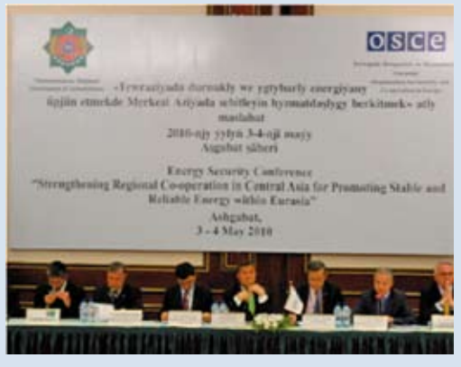
Conference participants at the International Energy Security Conference on 3-4 May 2010 in Ashgabat.

The importance of developing stronger international governance for global energy supply on the basis of clearly identified legal norms and mechanisms was highlighted in the course of the conference. It was underlined that balanced and fair rules in the energy sector were as vital as they were in any other part of the economy. Equally, energy co-operation should be driven by a balanced approach - taking into account the interests of production and development, transportation and consumption. Turkmenistan's contribution to these goals, embodied in the form of a resolution at the 63rd UN General Assembly Session 2008