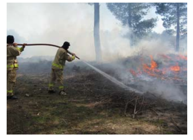
Forest fire management training in Antalya, Turkey.

in co-operation with the UNECE Water Convention Secretariat, is assisting Georgia in a step-by-step process of ratifying the UNECE Water Convention, an important legal instrument for regulating the use of transboundary water resources. Moreover, a first of a series of consultations between Azerbaijan and Georgia were organised by the OCEEA and UNECE to facilitate the preparation of a bi-lateral water agreement.