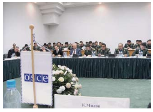
Training for 100 customs officers at the Uzbek State Customs Committee in Tashkent, December 2009.

These documents were discussed during a two-day regional round table in Tashkent on 10-11 December 2009 with representatives from Kazakhstan and the Kyrgyz Republic and international experts from the UNECE, the International Road Transport Union (IRU) and OTIF. The meeting was preceded by a training course on customs procedures, focusing in particular on the UNECE International Convention on Harmonization of Frontier Controls of Goods (and its annexes 1-8). The training gathered around 100 officers of the Uzbek Customs Committee and was made possible through an ExB contribution of the United States.