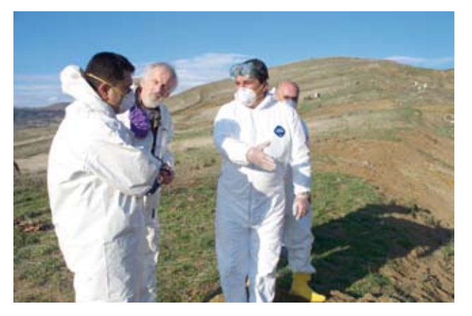
Pesticides burial site near Yerevan.

In March 2010, the ENVSEC Initiative responded to an urgent request received by the OSCE Office in Yerevan from the Armenian Ministry of Emergency Situations regarding a pesticides burial site near Yerevan, which according to old records, contains over 500 tons of dangerous and banned organ-chlorine pesticides such as DDT. The OCEEA hired an international expert to travel to Yerevan to assess the burial site and found an emergency situation with pesticides uncovered and exposing an imminent health risk to nearby village populations. As a result of the ENVSEC assessment, the Armenian government has committed financial resources to implement emergency measures and several international organizations are currently discussing long-term remediation of the site in coordination with the OSCE Office in Yerevan.