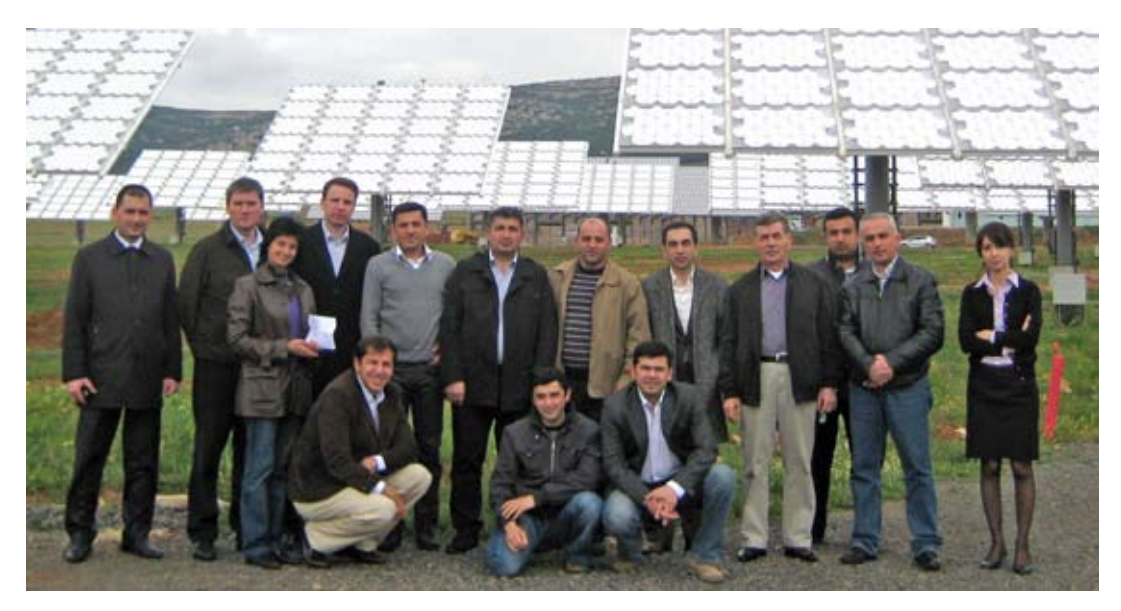
Participants of the Study tour to Spain.

In December 2009, the OSCE Office in Minsk, in coordination with the OCEEA and the Ministry of Foreign Affairs, organised an Eastern Europe Experts' Seminar on the Security of Critical Energy Infrastructures. The event brought together experts from specialized organizations,