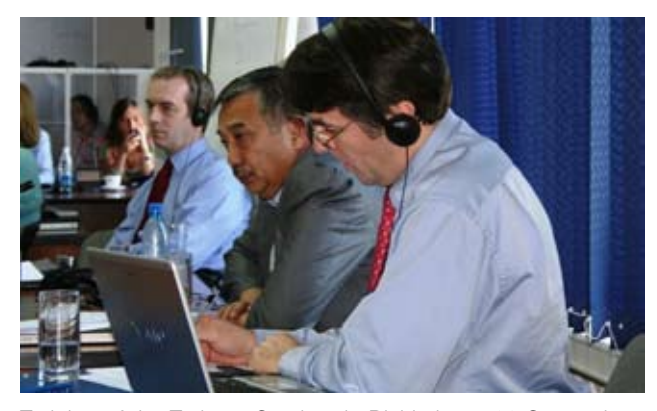
Training of the Trainers Seminar in Bishkek, on 29 September - 1 October 2009.

The first regional Training Seminar on Gender and Labour Migration was organised on 15-16 April 2010 in Helsinki by the OCEEA in co-operation with the Finnish Government, the IOM, ILO, ODIHR and the Council of Europe. The training materials used for the seminar were the OSCE Guide on Gender-Sensitive Labour Migration Policies , and the new Trainer's Manual on Gender and Labour Migration . The training was attended by mid-level government officials, representatives of labour unions and employers' organizations from the Nordic, Baltic and Western CIS countries. The training was built around group discussions