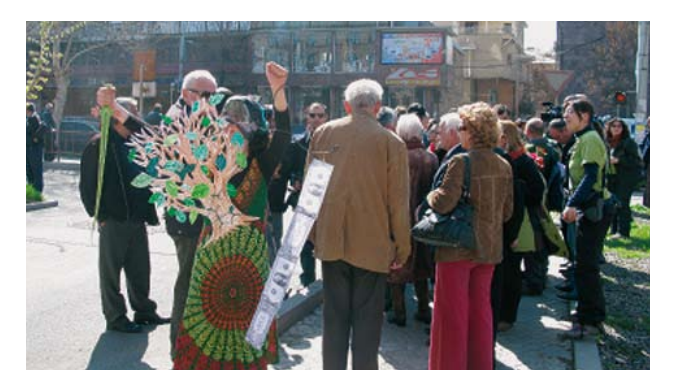
Celebration of the Earth Day in Armenia.

The OSCE Office in Yerevan, in partnership with the fourteen Aarhus Centres and International