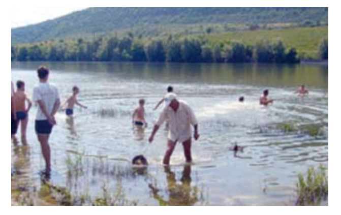
Participants in the summer school cooling off in the River Dniestr/Nistru.

In July 2009, in order to support contacts between