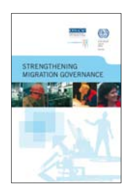
OSCE-ILO Publication on migration "Strengthening migration governance".

To share information on how to strengthen the links between migration and development, the OCEEA and the IOM organised with the support of the Austrian Government a Regional Conference on Migrant Investment, Return and Economic Reintegration for Development in the South-Eastern Europe and Central Asia regions in Vienna on 10-11 December 2009. The aim of the conference was to discuss new research findings on the potential of migrants' savings for