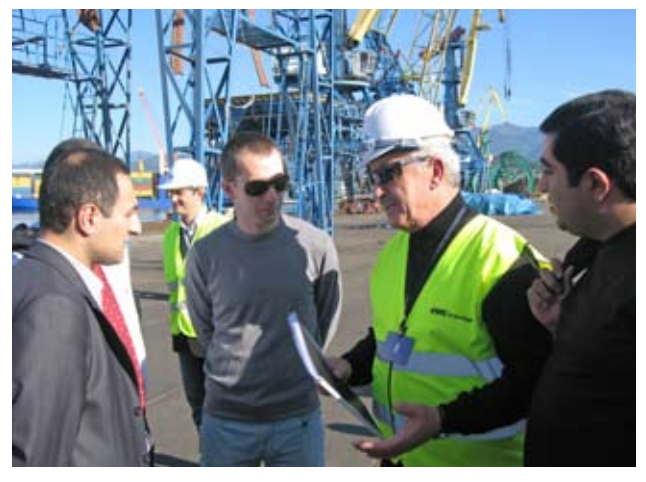
Participants of an OSCE seminar on a study visit to the port of Batumi, which is undergoing reconstruction, 6 November 2009.

On 5-6 November 2009, the OCEEA organised, with the support of the Government of Georgia and financial contributions from Belgium and France, a regional seminar in Batumi, Georgia, on the promotion of good governance and fighting corruption in the area