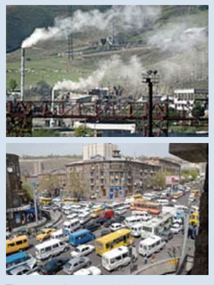
Threats to the natural environment.

However, what the project showed in abundance is that both genders are equally concerned about the overall state of the environment, that civil society is ready and willing to take part in the decision making process and that there is an overwhelming need for more information.