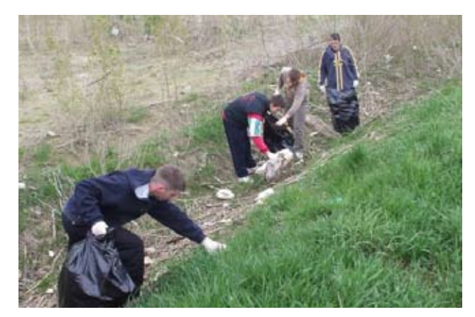
"My Town - Clean Town" project from Orasje. A group of young people collect garbage along the Sava River.

The Mission also facilitated a similar process in the municipality of Posušje where citizens and local government worked together to develop a Local