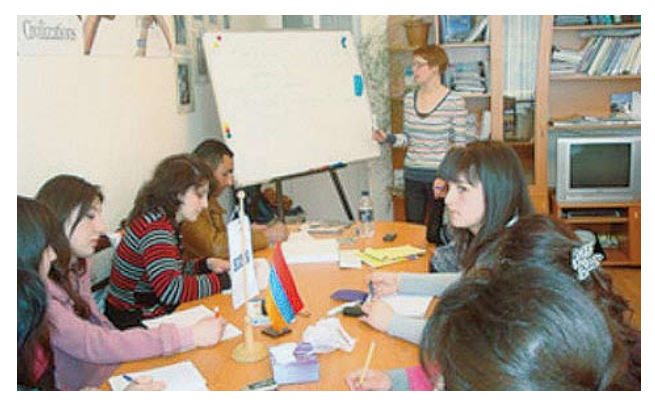
Workshop in one of the Aarhus Centres in Armenia.

democratic, effective and good governance.