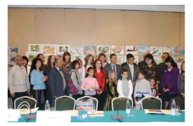
Winners of the photo and painting contest for young people in Tashkent and participants of the round table held in November 2009.

The objective of this project was to support government policies and strategies in Uzbekistan to protect the environment and natural resources by using them in a sustainable way. The first component of the project analyzed modern normative and legal best practices of nature protection in the field of waste management, such as analysis of statistical data and its improvement. Landfills are no longer a valid and secure possibility to deal with waste, thus it became necessary to elaborate a business plan for a waste incineration plant. In co-operation with the Federal Environment Agency of Germany, the OSCE Project Co-ordinator in Uzbekistan (PCUz) organised a study tour to Hamburg for Goskompriroda experts to study in detail German waste incineration plants and their management. The project's second component looked into possibilities concerning nature protection and waste management. Here, the PCUz co-operated closely with the Environmental Movement of Uzbekistan. In addition, a photo competition for children of different age groups and adults was organised in Tashkent. In October, the PCUz conducted a round table with extensive media coverage during which the winners of the competition received their prices and experts and project partners discussed the results of the studies done with the media, trying to raise public awareness on the waste issue in the country.