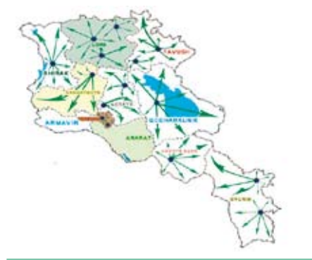
Network of Aarhus Centres in Armenia.

Publications of the Armenian Aarhus Centres.