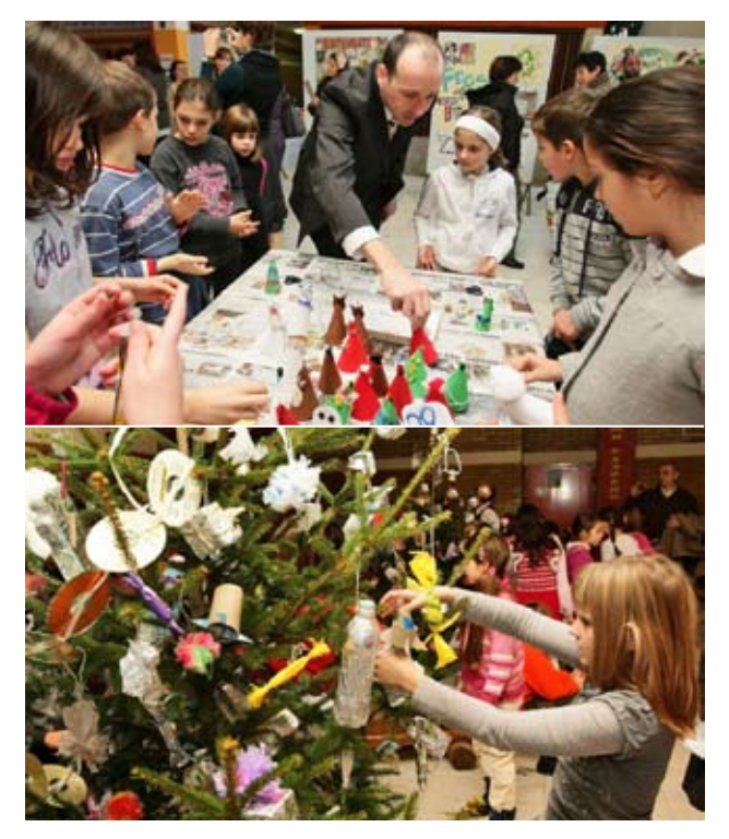
Workshop on recycling with the primary schoolchildren.

The overall goal of the project was to familiarize high school students with a better understanding of energyrelated problems and raise their awareness of renewable