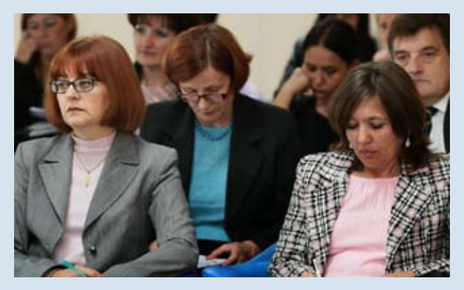
Participants of the seminar on climate change implications.