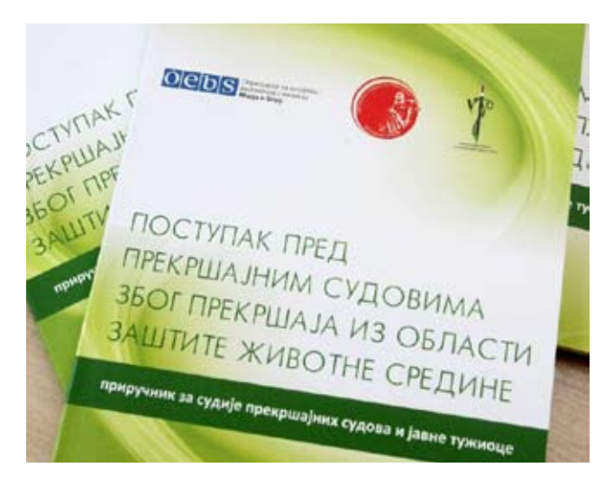
Manual on Procedures on Environmental Violations before Misdemeanour Courts.