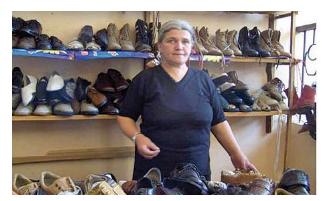
Used clothing market opened by micro-loan recipient in Puke in northern Albania.

The OSCE Presence in Albania (PiA) has implemented a Women Economic Empowerment project focused on building institutional capacity in northern Albania for improving income generation opportunities for vulnerable groups. The Presence has partnered with a local microfinance institution to provide business support, advisory services and access to microloans to some 40 vulnerable women in three regions. Providing women access to the micro-loans is widely seen as a successful strategy in alleviating poverty. The loans have targeted both rural and urban areas and