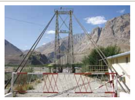
Looking to Afghanistan from Khorog, Tajikistan. Photo taken during the assessment phase of the Office in Tajikistan's customs assistance project.

Some months earlier, in October 2009, a first contingent of a dozen Afghan border police detachment commanders crossed into Tajikistan to take part in a workshop designed to revive the mechanisms of the border delegates. These are mechanisms that were put in place between the Soviet Union and Afghanistan in 1958 and have been on hold since 1991. The cross-border co-operation workshop, which runs under the unified budget of the Office in Tajikistan, was repeated in 2010 and will be held again in 2011, advancing further each time towards reviving the co-operation mechanisms.