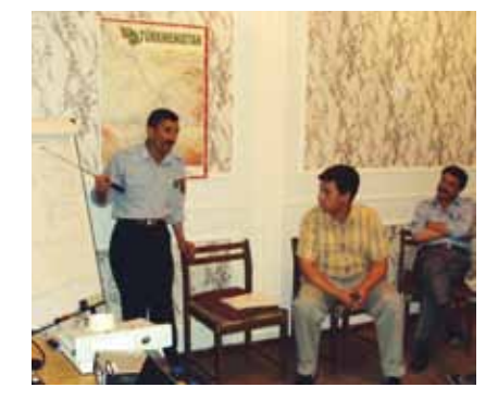
Two Afghanistan customs officers (in uniform) speaking to their Turkmenistan counterparts, Atamyrat, Turkmenistan

These projects were the first of the OSCE border projects actually implemented in support of the 2007 MC decision on engagement with Afghanistan, and proved useful to all stakeholders, as the co-operation and co-ordination they established has continued through all other engagement activities.