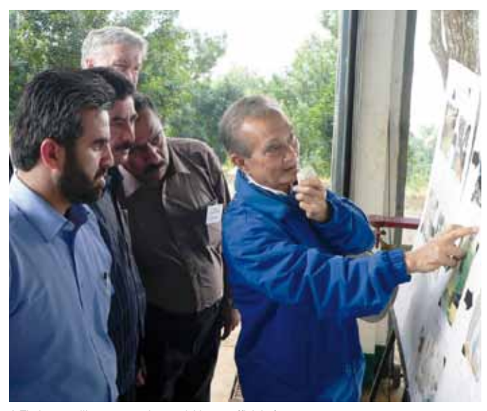
A Thai expert illustrates project activities to officials from Afghanistan and OSCE Ambassadors

n 2010, ten Afghan officials, including the Deputy Minister of the Interior in Charge of Counter-Narcotics, took part in the Workshop on Combating Illicit Crop Cultivation and Enhancing Border Security and Management: Thailand as a Case Study , held from 24 to 28 January 2010 in the Chiangmai and Chiangrai provinces of Thailand. They were sponsored with contributions from Finland under the Partnership Fund, established in 2007 to sponsor Partners for Co-operation to participate in OSCE activities.