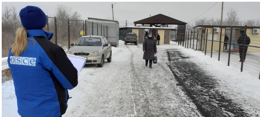
SMM monitoring officer at the Stanytsia Luhanska entry-exit checkpoint, Luhansk region