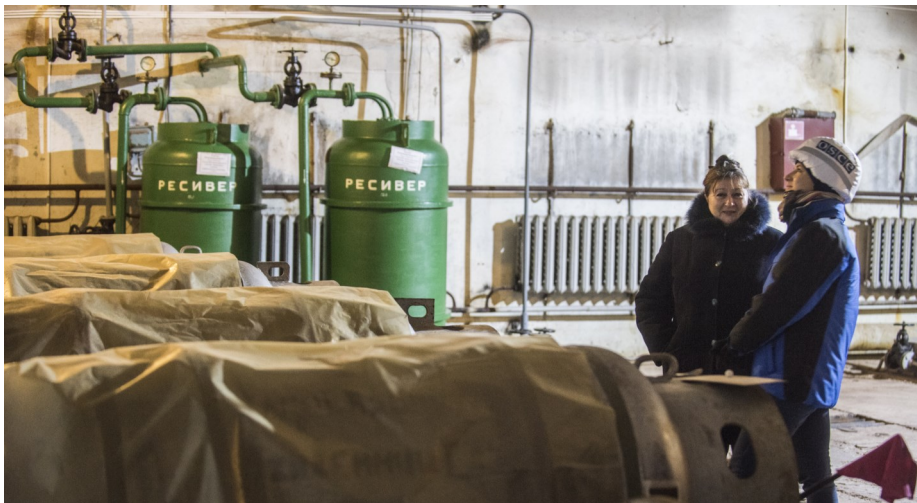
OSCE monitors at the Donetsk Water Filtration station