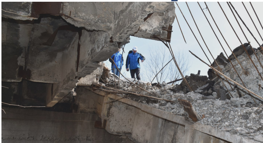
OSCE SMM monitors near the damaged bridge in Klischiivka, Donetsk region