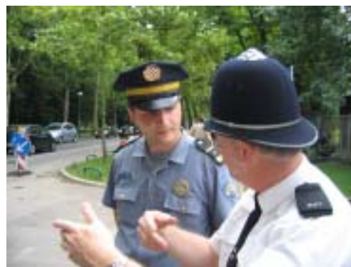
UK's Bobby of the Year gives tips to his younger Croatian colleague.