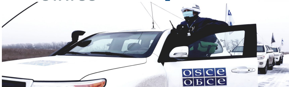
An SMM patrol on the road near Bohdanivka, inside the Disengagement Area near Petrivske, Donetsk region