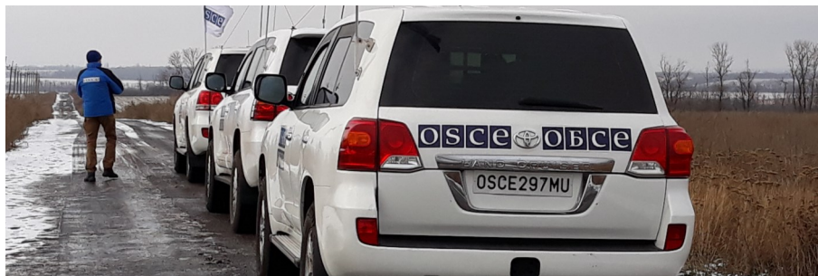
An SMM patrol near Bohdanivka, Donetsk region