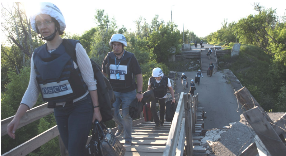
OSCE SMM monitors crossing Stanytsia Luhanska bridge, Luhansk region, May 2016.