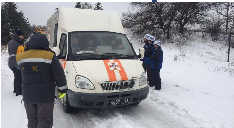
OSCE monitors at the Donetsk filtration station facilitate and monitor adherence to ceasefire to enable repair works at power lines, 4 February 2017