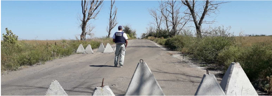
SMM monitoring officer near Lebedynske, Donetsk region