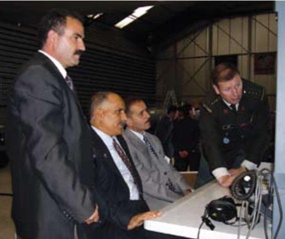
A Belgian military officer briefs experts from Mediterranean Partner Countries on the verification system of the Open Skies Treaty.

• Engaging in a dialogue to consider an adequate framework that could create