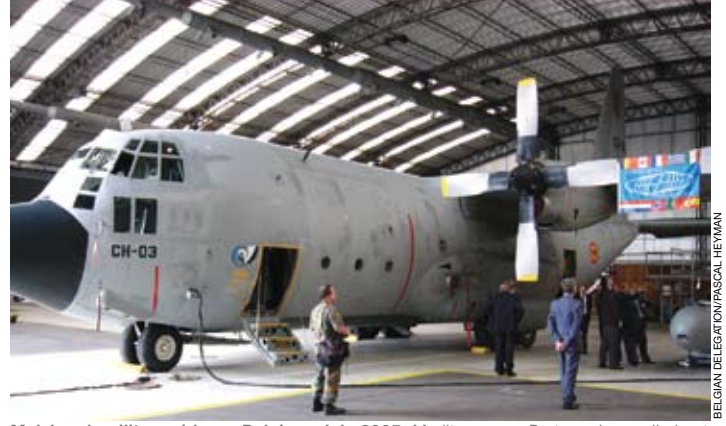
Melsbroek military airbase, Belgium, July 2005. Mediterranean Partners learn all about the role of the Open Skies Treaty in building confidence among States.

Political dialogue promotes mutual understanding, while providing us all with an opportunity to seek a convergence of positions concerning major international developments.