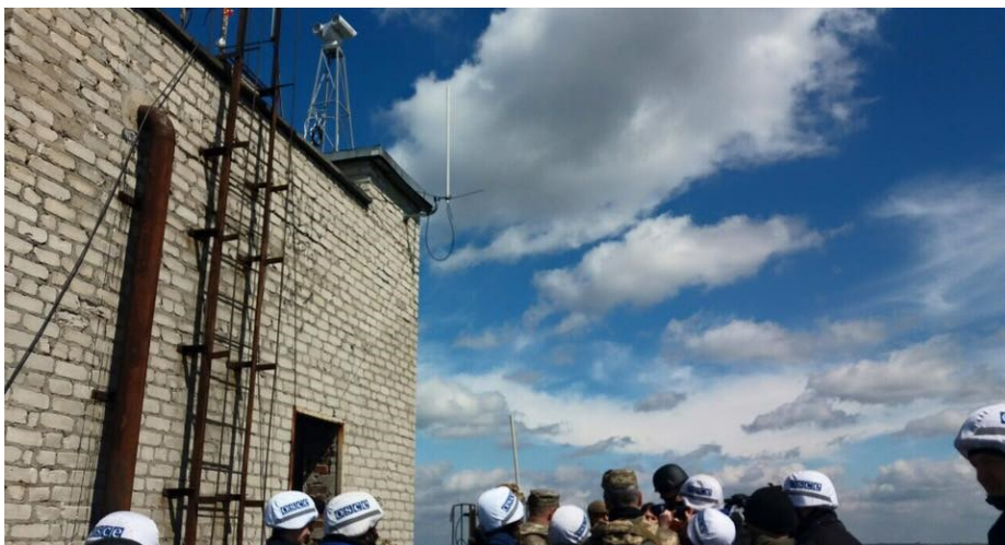
OSCE SMM installed two cameras: one in Avdiivka and another one at Oktiabr mine, April 2016.