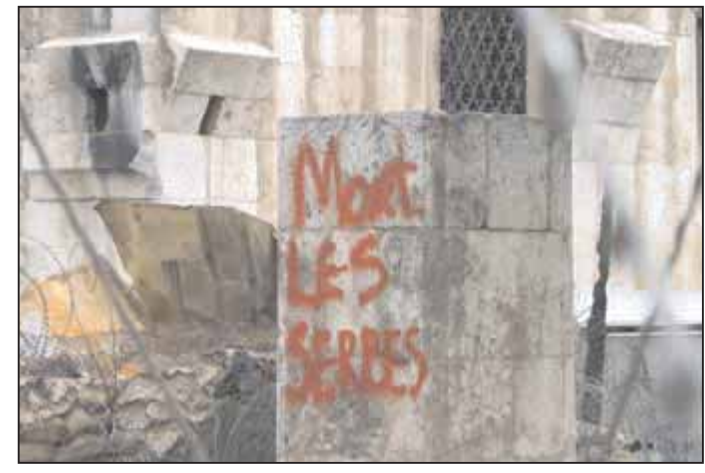
TMC concludes that RTK was chiefly if not exclusively responsible among the three Kosovo-wide television broadcasters for transforming the deaths of three boys from a tragic news story into dangerous political theater.