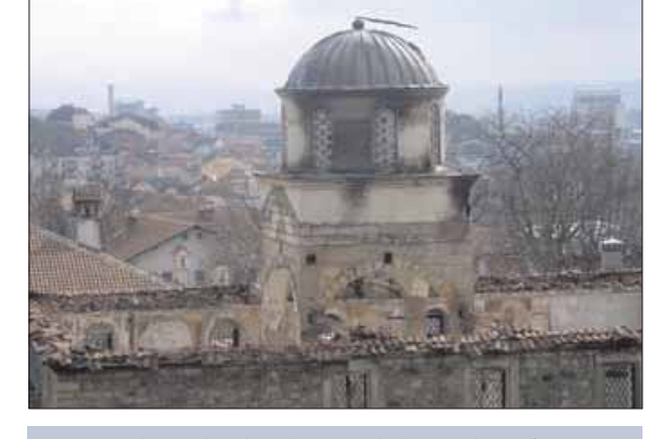
Burning down the church: St. Nikola, Prishtinë / Priština.

Nevertheless as Details is being printed, roughly a month after these events, a certain number of people is already getting ready for returning to refurbished homes, notably to the "Yu programme" building in the center of Prishtinë/ Priština. A ray of hope, maybe.