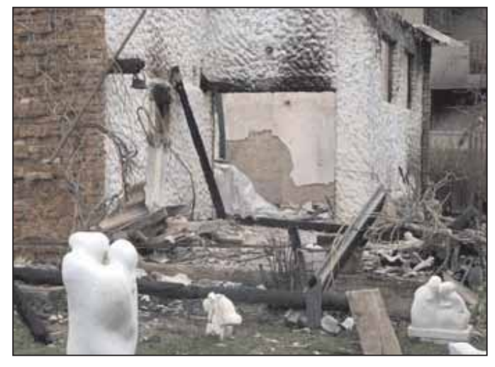
The Artist's home was burned down during the riots:" I never imagined such a thing could happen..."

Sebi looks back at her husband's sculpture "Sofra" which has been cut in half, while she closes the gate of the burnt-down gallery.