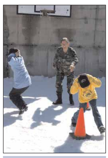
US KFOR in action.