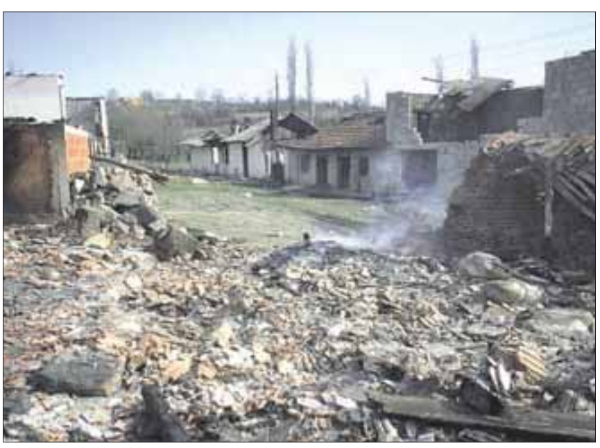
Svinjare/Frashër: half-Albanian and half-Serb. We were horrified to see this village burning and dying.

We remained on the camp for a total of 6 days, listening to radio broadcasts for information. We could do nothing but sit there and wait for our release. However, we all knew that with our release--which came a week after the rioting and violence--we would all be faced with a Kosovo that was drastically different than the one which we left prior to sanctuary in the walls of the bomb shelter on the first night. We were and are all asking ourselves - "What now?"