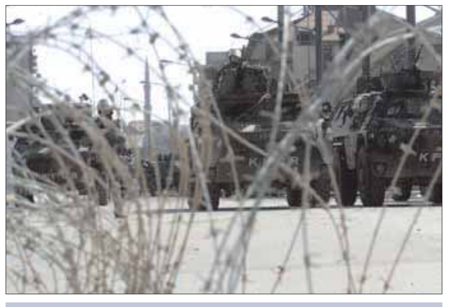
"Spring was in full bloom and everything seemed normal that day when we heard the news....

With all those events, it is logical that we were not able to do much. I called one of my office colleagues, member of the Serb community,