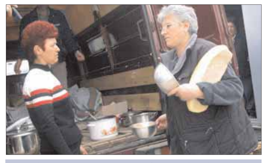
"Barely surviving" in a IDP camp in Gracanica / Graçanica.

In, Laplje Selo and Preoce, most of the displaced persons accomodated were from Obiliq / Obilic and Caglavica. Srdjan (24) told us that few