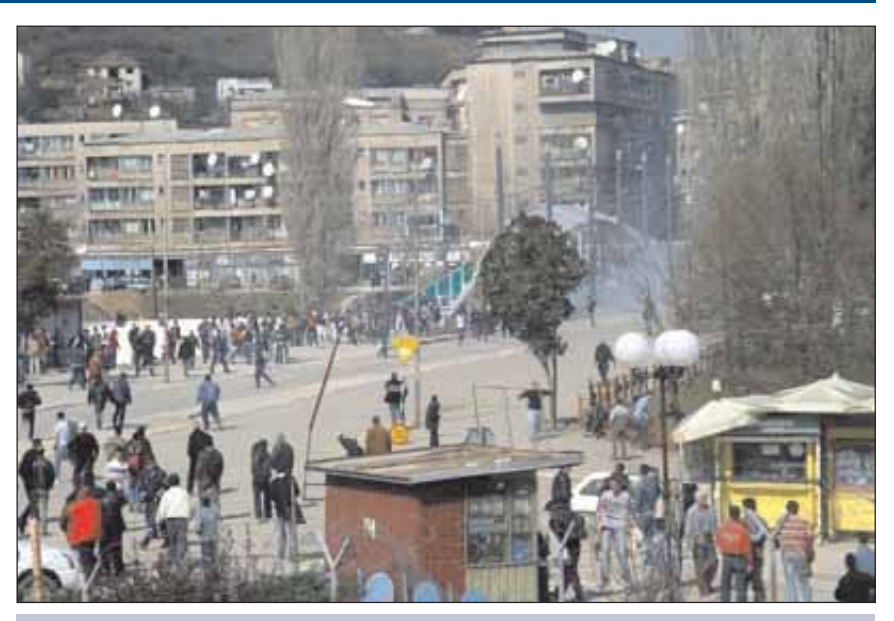
Young demonstrators during the mid-March riots in Mirtovicë / Mitrovica town/Kosovo. Photo UN.