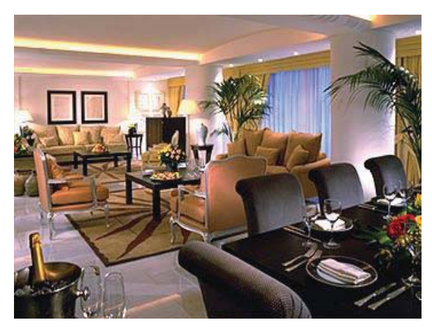
indoors and on our rooftop terrace.

With a spectacular view overlooking the Acropolis, the Athens Ledra Marriott is just minutes from Plaka and Piraeus Port for a quick Greek Island holiday. From our hotel in central Athens, you can stroll the winding streets of Plaka to the city's famous cafes and shops. Among hotels in Athens, we are the only to offer spacious double-double accommodations that include mini-bars, safes, individual climate controls, broadband Internet and luxury bedding. Enjoy great amenities at our Athens hotel - take a dip and enjoy the Acropolis view from our seasonal rooftop pool, stay fit at our 24-hour fitness club, or relax with a cocktail while listening to live music in our on-site lounge. After meetings or sightseeing, enjoy a Mediterranean or Greek dinner at Zephyros Restaurant or indulge in Polynesian cuisine and fresh sushi at Kona Kai. When planning a business or social event, the Marriott hotel in Athens, Greece, creates magical moments