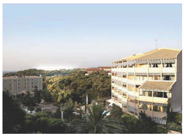
the sea, the Tennis Club, the lake of Vouliagmeni and the nightlife of the coastline.

Distance from Conference Venue: approx. 8,5 km