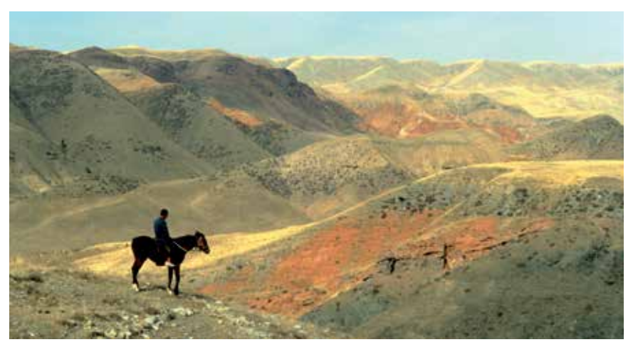
Southern Kyrgyzstan, Osh Region.

A Central Asian country of incredible natural beauty and proud nomadic traditions, most of Kyrgyzstan was formally annexed to Russia in 1876. Kyrgyzstan became a Soviet republic in 1936 and achieved independence in 1991 when the USSR dissolved.