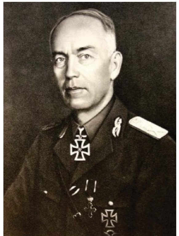
Hitler's ally Romanian dictator Ion Antonescu admired by President of Romania

For the people of the Gagauz autonomy, today's appeals of the pro-Romanian politicians are nothing but the continuation of the tragic events of the 1990s, when these politicians were trying to suppress their will by force.