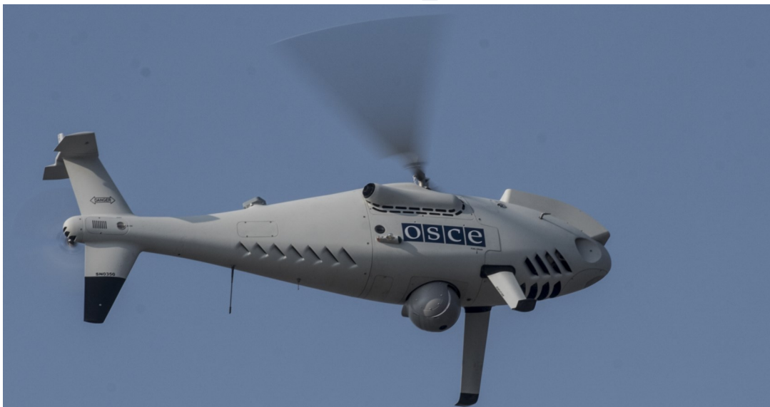
An SMM long-range unmanned aerial vehicle.