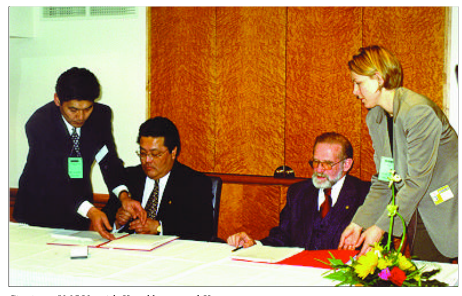
Signing of MOUs with Kazakhstan and Kyrgyzstan

An ODIHR representative visited Kosovo from 9 to 16 December to help with the development of a human rights structure for the KVM, and in particular to help