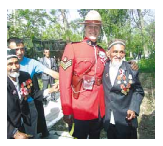
Victory Day celebration honouring World War II veterans, Isfana, 9 May 2012

If we have contributed to a more stable security environment in Isfana and its surroundings, it is because we were able to improve the relationship between governmental institutions and the local population. Bridging this gap is an arduous task in any nation. My experience in Canada as well as abroad has reinforced my belief that a civilian police entity must act as a key pillar in the construction of this bridge. In Isfana, relations between government and citizens typically have a tribe or clan affiliation. Once one becomes aware of these, one can use this knowledge to create a path for dialogue and understanding. Participation in public events and personal activities such as birthday or wedding celebrations proved a good way for us to create conduits for meaningful information sharing. We coupled this with an ongoing appraisal of how the Kyrgyzstan Police engages with both government and the population.