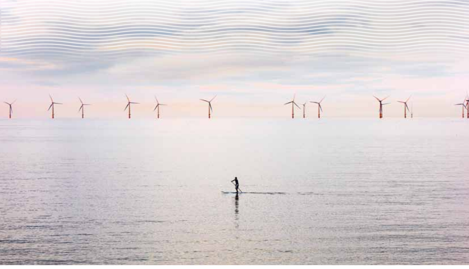
A surfer paddling by a wind farm off Colwyn Bay, North Wales, UK