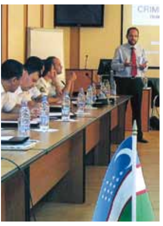
An OSCE seminar on the role of the police in crime prevention, Tashkent, September 2009 (Academy of the Ministry of Internal Affairs of Uzbekistan)

Read more at: www.osce.org/ policestrategicframework