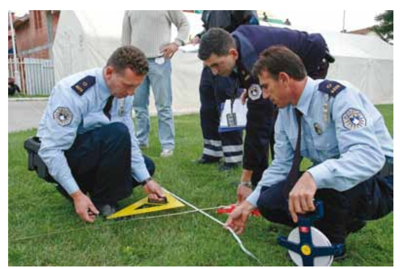
Crime scene investigation training at the Kosovo Centre for Public Safety Education and Development (OSCE/Mission in Kosovo)

"The promotion of these principles and elements of democratic policing is the foundation of the OSCE's police-related activities. They should be taken into account constantly in the process of police development and in the comprehensive approach to reform of criminal justice systems, as well as in the fight against transnational threats."