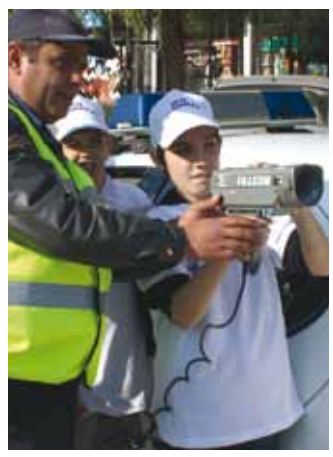
Children accompany police officers in measuring speed using radar, as part of the OSCE-supported project Child-Police Officer for a Day in Kumanovo, former Yugoslav Republic of Macedonia, November 2011.