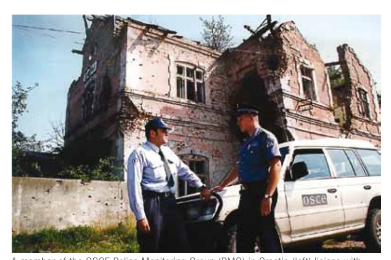
A member of the OSCE Police Monitoring Group (PMG) in Croatia (left) liaises with a Croatian police officer outside the ruins of the Vukovar railway station, September 1999. The PMG was one of the OSCE's early success stories in policing. It ceased operations on 31 October 2000.