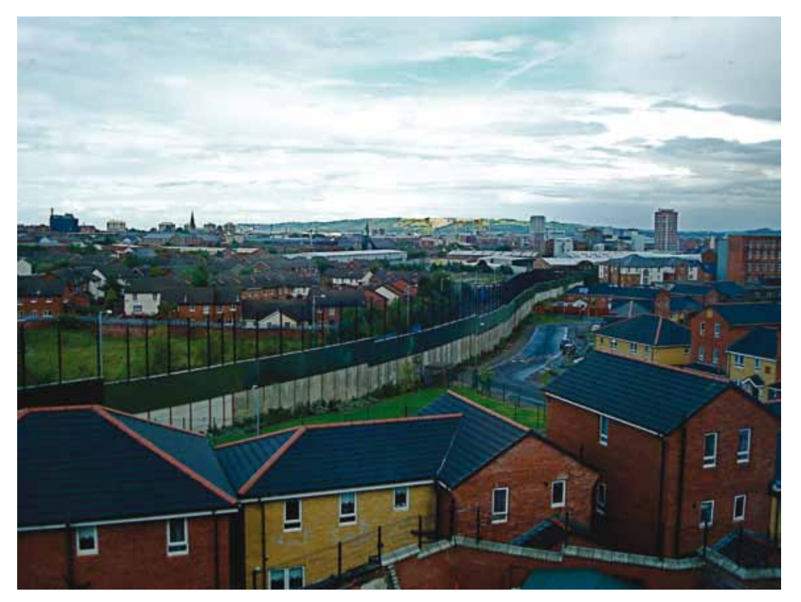
Peace wall in Belfast seen from an upperstory window in Clonard Monastery, site of clandestine peace talks between Catholic and Protestant militia leaders during the Troubles, the darkest time of the conflict in Northern Ireland

involved, don't question and stay silent. "What is the point in getting involved?" is a statement I often hear. "It won't make any difference. That's just the way it is. Nothing will ever change. Who would listen to me?"