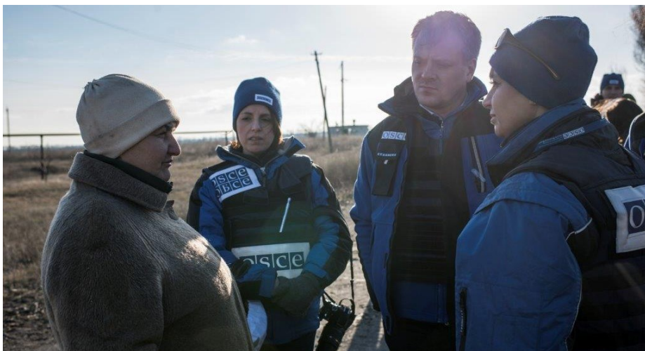
OSCE SMM monitors talking to a civilian in eastern Ukraine.