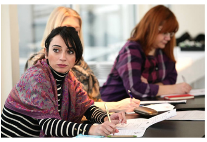
Participants of a training programme on establishing mentor networks, organized by the OSCE's Gender Section in Belgrade

"Mentoring relationships are a powerful tool for helping to overcome obstacles to women's empowerment and full inclusion in politics, business and society"