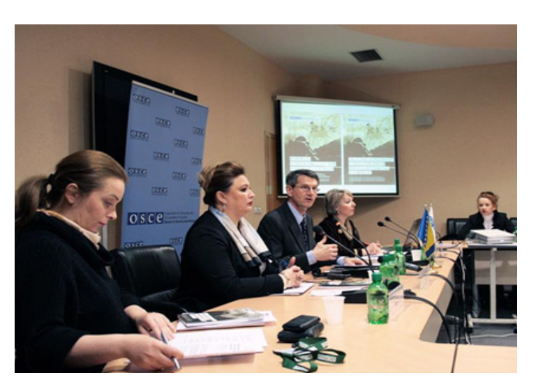
implementation of the Mission's programmes. The latter will include the development and application of a gender-sensitive methodology for conflict analysis.

The OSCE Mission to Bosnia and Herzegovina has developed its 2013-2015 Action Plan for the Promotion of Gender Equality. The document provides a comprehensive framework for the implementation of the 2004 OSCE Gender Action Plan together with other OSCE commitments and international standards in the field of gender equality. The Action Plan identifies the Mission's priorities and seeks to achieve the following objectives: to assist BiH authorities in meeting their obligations in promoting gender equality; to promote gender equality and gender mainstreaming through the Mission's policies and management practices, and to strengthen gendermainstreaming in the design and