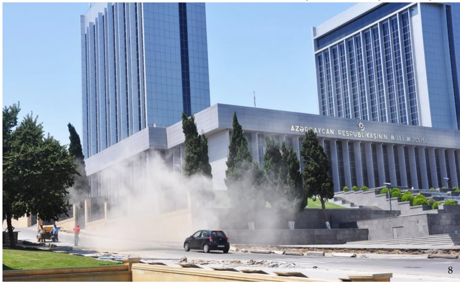
2013 First Quarterly Freedom of Expression Report