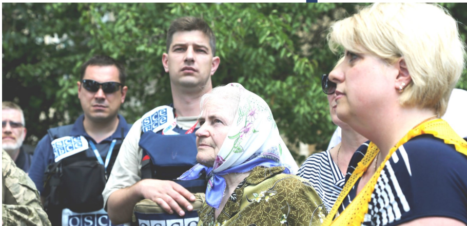
SMM monitors in conversation with civilians in Krasnohorivka, Donetsk region, 21 June 2017