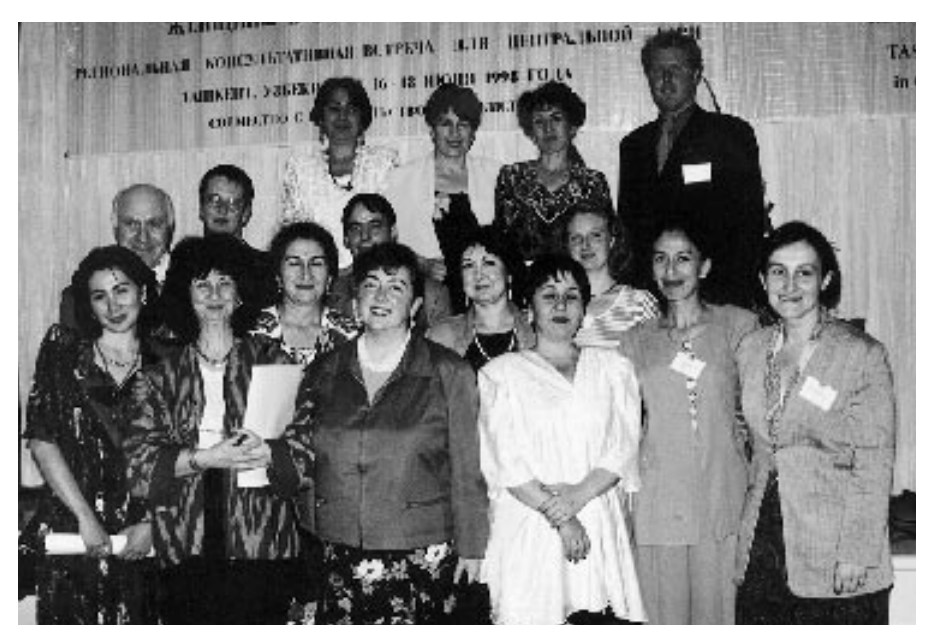
Participants in the regional consultation on Women in Public Life in Central Asia

their experiences and develop co-operation. The second aim was to develop an ODIHR women's human rights programme in the region with concrete follow-up projects to be included in the Memoranda of Understanding between the ODIHR and the Governments of Kyrgyzstan, Kazakstan and Turkme-