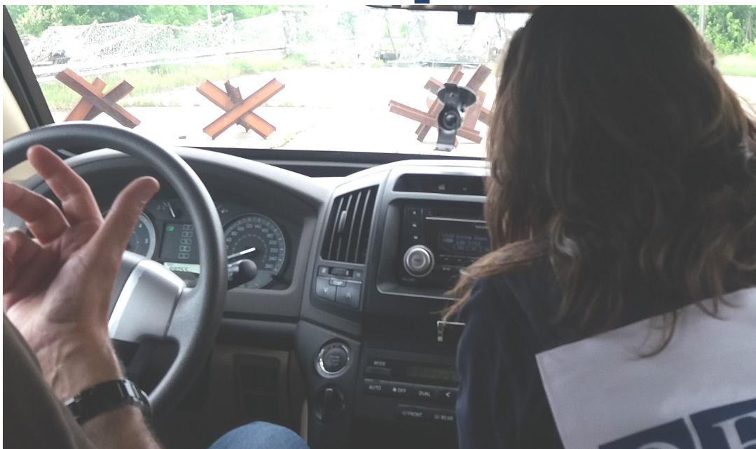
The SMM's freedom of movement remained restricted, including due to the presence of mines and unexploded ordnances.