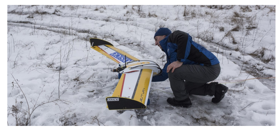
SMM monitoring officer preparing to launch a UAV in Luhansk region