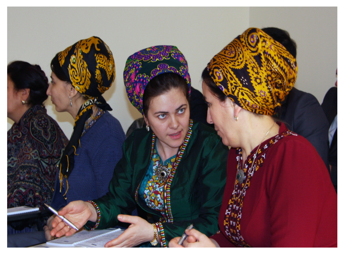
Journalism instructors from Turkmenistan's higher education institutions at an OSCE Centre-organized seminar on innovative methods of teaching journalism, Ashgabat, 21 February 2014.