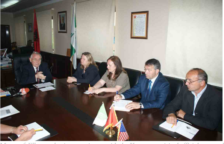
or of Elbasan sharing experiences with the Kosovo municipal officials on gender

As a result of the 2013 OMiK capacity building programmes, municipal officials reported that there is a significant increase of understanding among municipal senior officials as well as intensified efforts to support activities that promote gender equality. The five municipalities have started to collect and analyse gender-disaggregated data on education, administration and health in order to have a more informed policy and budget development process. Municipal officials for gender equality are more involved in the budget process, there is more financial support for gender related activities, and in three of the five municipalities' gender related activities have their own budget codes. In 2014, OMiK will continue working with these municipalities and will expand to an additional five municipalities.