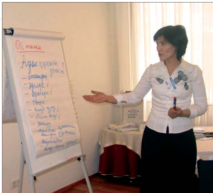
Conducting joint activities with civil society partners: a discussion of environmental issues at an OSCE workshop on the implementation of the Aarhus Convention in Almaty, Kazakhstan, March 2005.

public awareness and education on the environment as well as the public reporting of the environmental impact of policies, projects and programmes” (Charter of Paris 1990). In Turkmenistan, to give an example, the OSCE has conducted a series of seminars promoting environmental education for secondary school students. A number of OSCE field operations and environmental protection groups have joined forces to carry out high-profile lobbying for the adoption and implementation of the Aarhus Convention on Access to Information, Public Participation in Decision-Making and Access to Justice in Environmental Matters. Evidence of these campaigns’ effectiveness includes public and governmental involvement in several environmental issues highlighted by the Organization, such as the