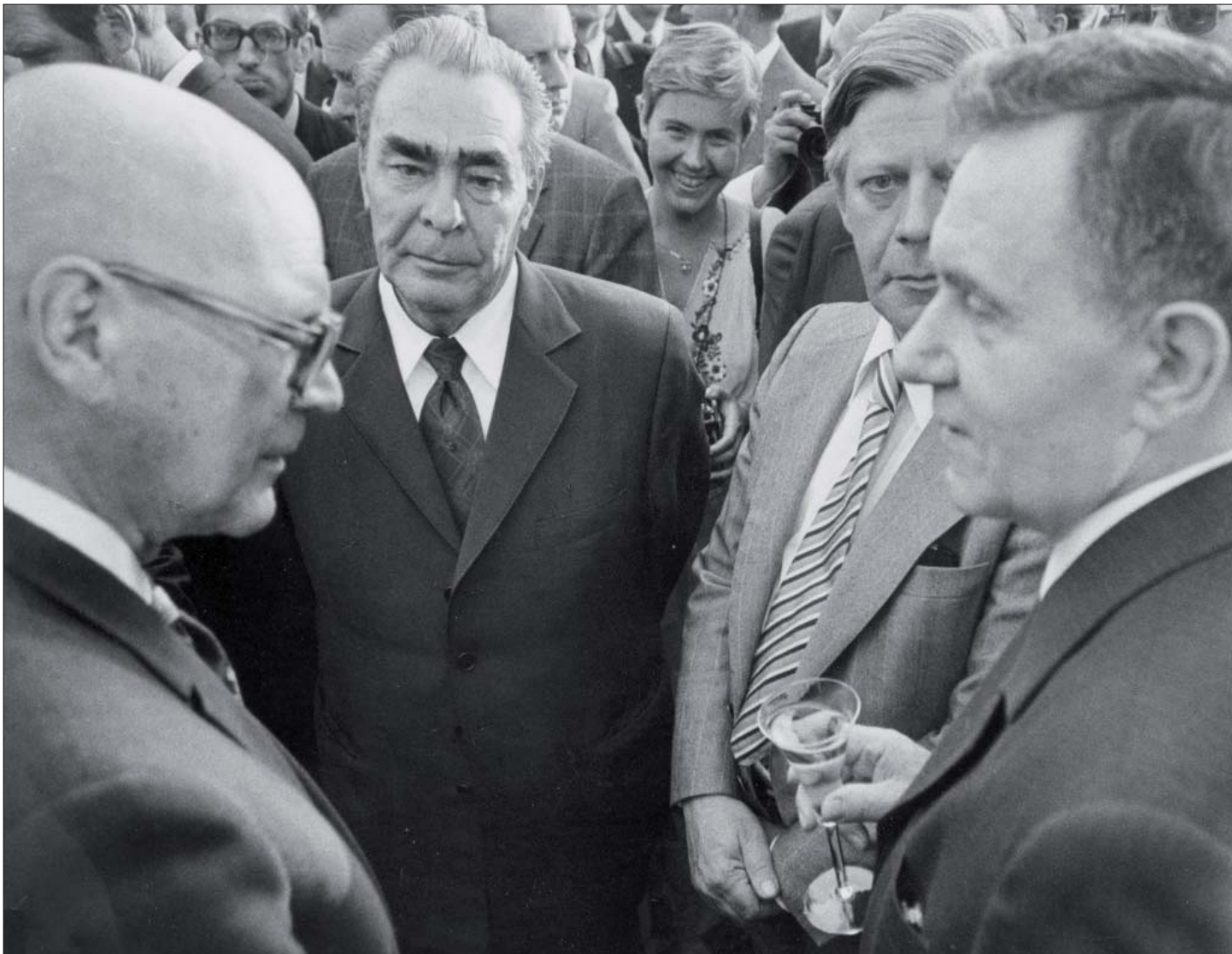
From left to right: President of the Republic of Finland Urho Kekkonen; General-Secretary of the Central Committee of the Communist Party of the Soviet Union Leonid Brezhnev; Chancellor of the Federal Republic of Germany Helmut Schmidt; Soviet Foreign Minister Andrei Gromyko.