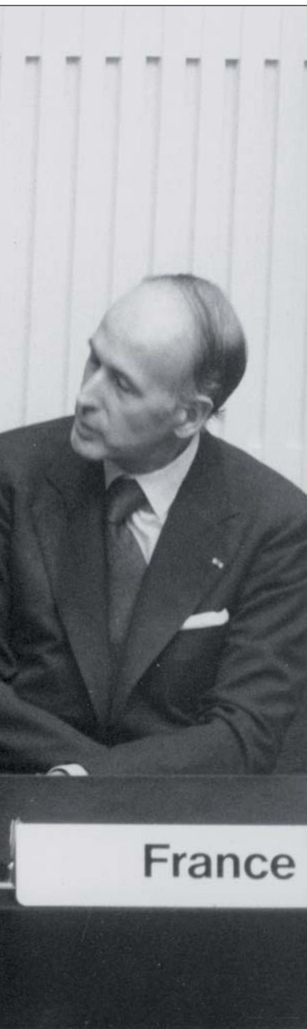
The signing of the CSCE Helsinki Final Act on 1 August 1975 marked the culmination of an intense series of diplomatic negotiations that had begun in the Finnish capital two years earlier. From left to right: The Head of the Government of Spain Carlos Arias Navarro; President of the Republic of Finland Urho Kekkonen; President of France Valéry Giscard d'Estaing.