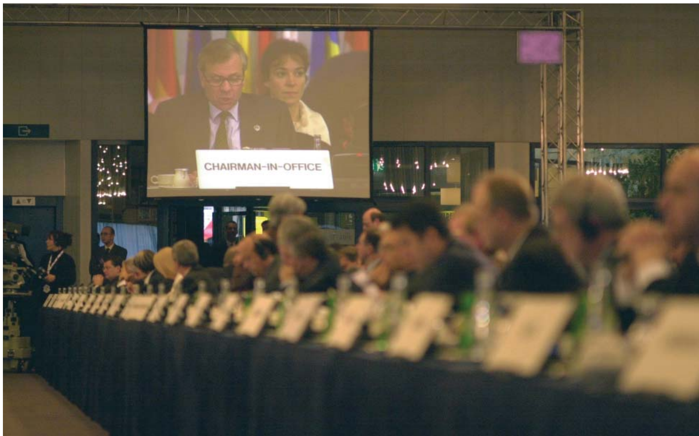
2003 Chairman-in-Office, Netherlands Foreign Minister Jaap de Hoop Scheffer, at the 11 th Ministerial Council, Maastricht, 1-2 December 2003.