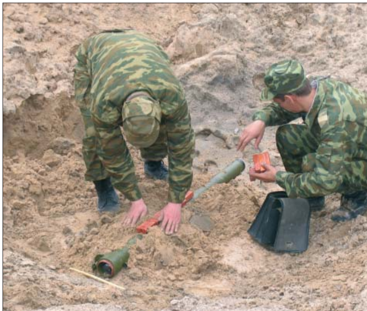
OSCE-supported activities to eliminate surplus small arms and light weapons: Belarusian soldiers prepare to destroy shoulder fired "Strela-IIM" anti-aircraft missiles near Sluck, Belarus, 25 May 2005.

the OSCE set up a Counter-Terrorism Network to strengthen contacts and facilitate the exchange of information.