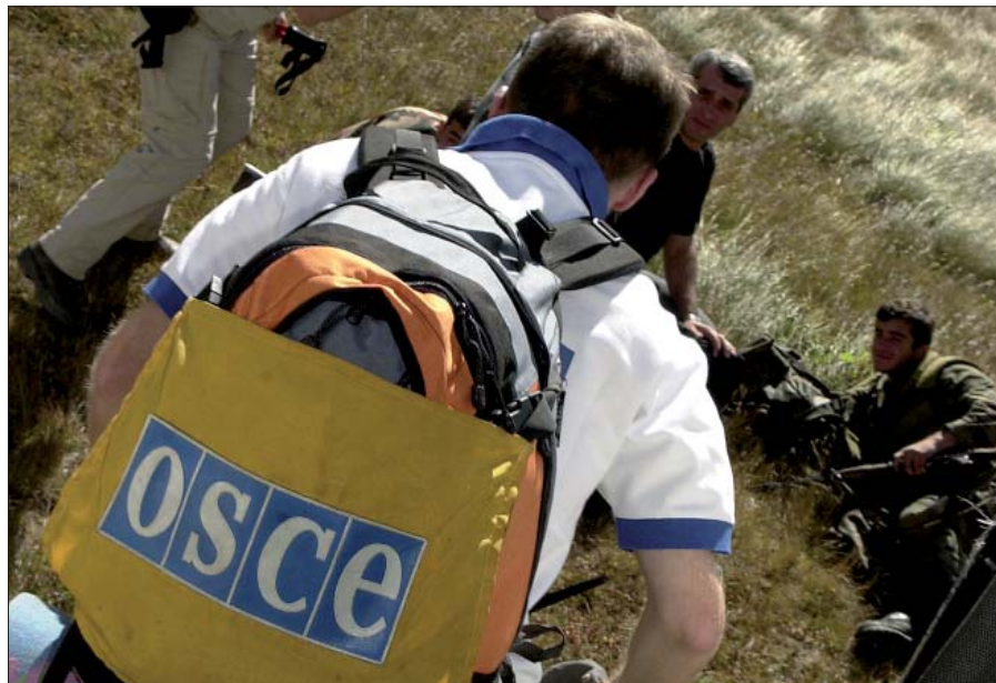
An OSCE border monitor disembarks from a helicopter during an overnight patrol in Shatili, Georgia, October 2002.

political parties and other organizations, to collect information, to make reports, and to establish contact points to co-ordinate the solution of problems identified. The Missions in Kosovo, Sandjak, and Vojvodina had to be closed in June 1993 because the OSCE and the FRY could not agree on an extension. After the unrest that approached civil war level in FYROM in spring and summer 2001, the Spillover Mission to Skopje was converted into a much larger post-conflict rehabilitation mission, whose primary concern is relations between ethno-political groups.