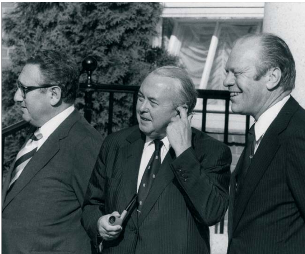
From left to right: US Secretary of State Henry Kissinger; Prime Minister of the United Kingdom Harold Wilson; US President Gerald Ford.