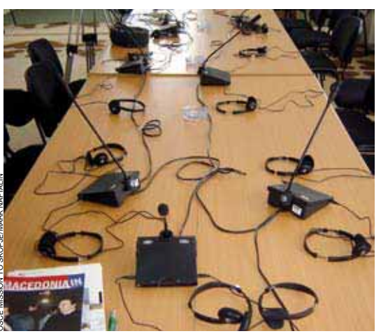
New translation equipment, courtesy of the OSCE, is facilitating dialogue in the multilingual municipality of Cucer Sandevo.

The fact that the Mission has been hosted by Skopje since September 1992, making it the Organization's longest-serving field presence, is proving especially useful in decentralization efforts. Backed by extensive experience and expertise on the ground, the OSCE is able to offer a broad range of technical support especially tailored to a municipality's specific needs and aspirations.