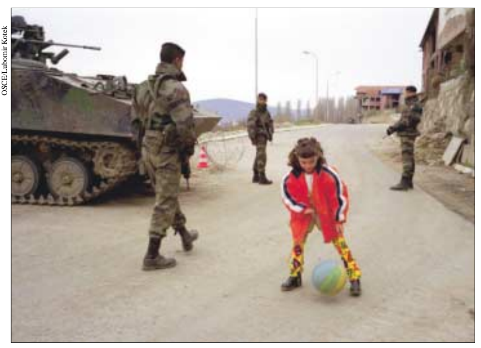
Life goes on in post-conflict northern Mitrovica, 1999