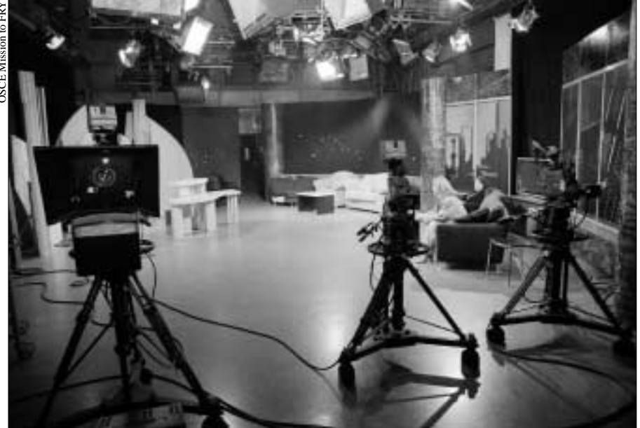
Overhauling Radio-Television Serbia will help satisfy Yugoslavs' hunger for reliable information

The OSCE opened its Mission to the Federal Republic of Yugoslavia in early 2001, immediately taking on the transformation of the country's media landscape as one of its major tasks. An article in the February issue of the OSCE Newsletter described how the Mission lost no time in setting a series of measures into motion, designed to turn the influential Radio-Television Serbia (RTS), the former regime's mouthpiece, into a broadcaster with world-class standards. Since a new, independent Board of Governors and qualified journalists have been in place, the quality and objectivity of news broadcasts have been on the rise, winning the confidence of viewers and listeners. This second instalment looks at what lies ahead.