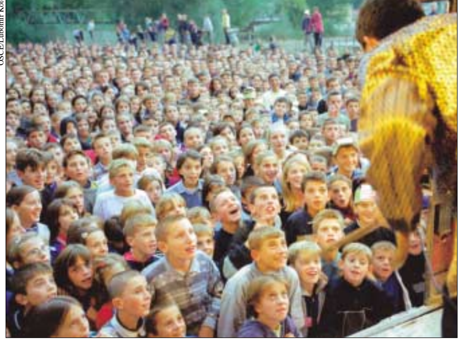
The next generation of voters in Kosovo learns the ABCs of elections at an OSCEsponsored roadshow, September 2001

The OSCE in Kosovo: September 1999 to December 2001, a retrospective look at the work of Czech photographer Lubomir Kotek, was on view at the Segmentgalerie, Hofburg Conference Centre, from mid-April to mid-May. Ambassador Joao de Lima Pimentel of Portugal, the Chairman of the OSCE Permanent Council, opened the travelling exhibition on 11 April. As the official photographer of the OSCE Mission in Kosovo, "Lubo" captured poignant moments in the history of the province over 27 months. The 30 pictures that were especially hand-picked for the exhibition also serve as a sensitively recorded overview of the Mission's work in promoting democracy, human rights and the rule of law and its impact on the day-to-day lives of the communities. First shown in Pristina, the pictures will travel to Prague, Berlin, Warsaw, Porto and Paris. To view the exhibit, please access: www.osce.org/photos