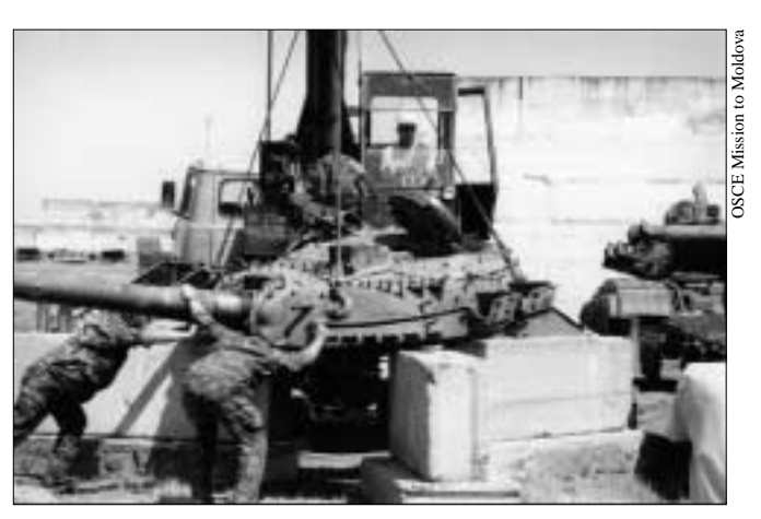
In Moldova, the destruction of heavy weapons started in June 2001 under the supervision of the OSCE

sectors and industries that were being converted into new sources of activities. Within the Commonwealth of Independent States, the conversion of military industries faced particularly formidable challenges because of the transition from a centrally planned system to a marketdriven one. Moreover, the conversion of the military-nuclear complex, especially in Russia, was a precondition for reducing the risks associated with the proliferation of lethal technologies, arms and matériel. Some international programmes aimed at supporting conversion in countries in transition had resulted in success stories, especially when funding and other incentives had been directed towards developing small and medium-