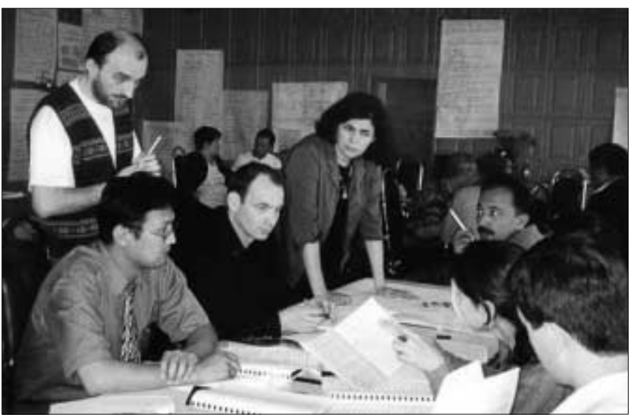
The ODIHR's democratization activities have been focusing heavily on Central Asia. Above, a human rights seminar in Uzbekistan

Ministry of the Interior. The ODIHR supports non-custodial measures as part of overall reforms in criminal justice, especially in the pre-trial phase and in the case of petty crimes. Disproportionate punishment policies, along with overcrowded prisons and poor prison conditions, add urgency to the need for the effective implementation of non-custodial punishment in Central Asia.